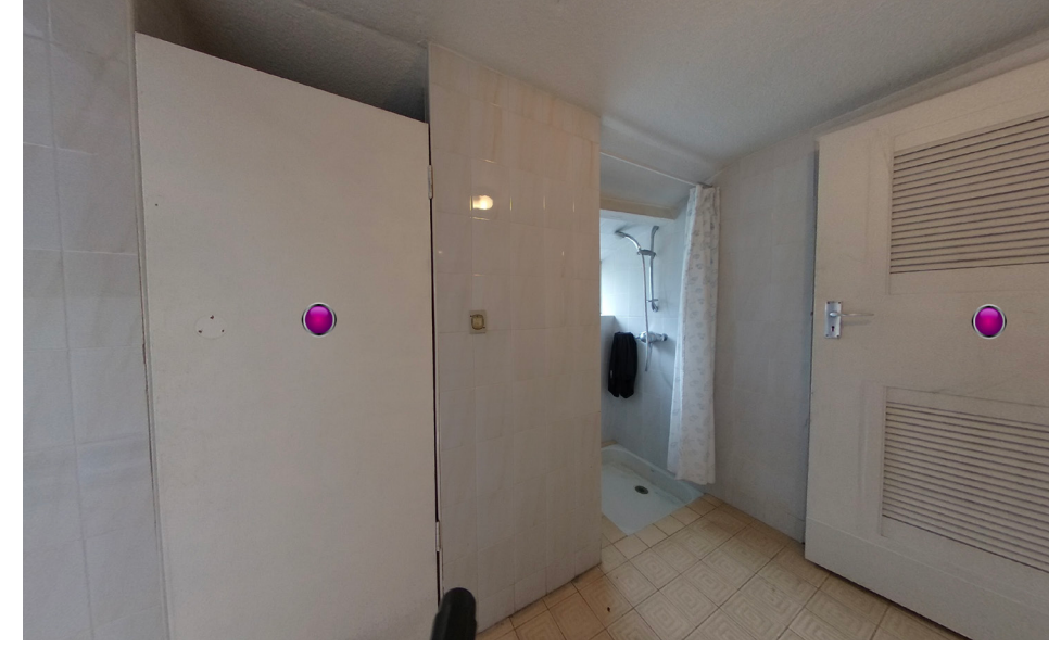
View of changing room interior

The existing external and internal walls are to be removed and replaced in a new configuration as shown in the proposed plans. A new flat roof is to replace the existing tiled roof.