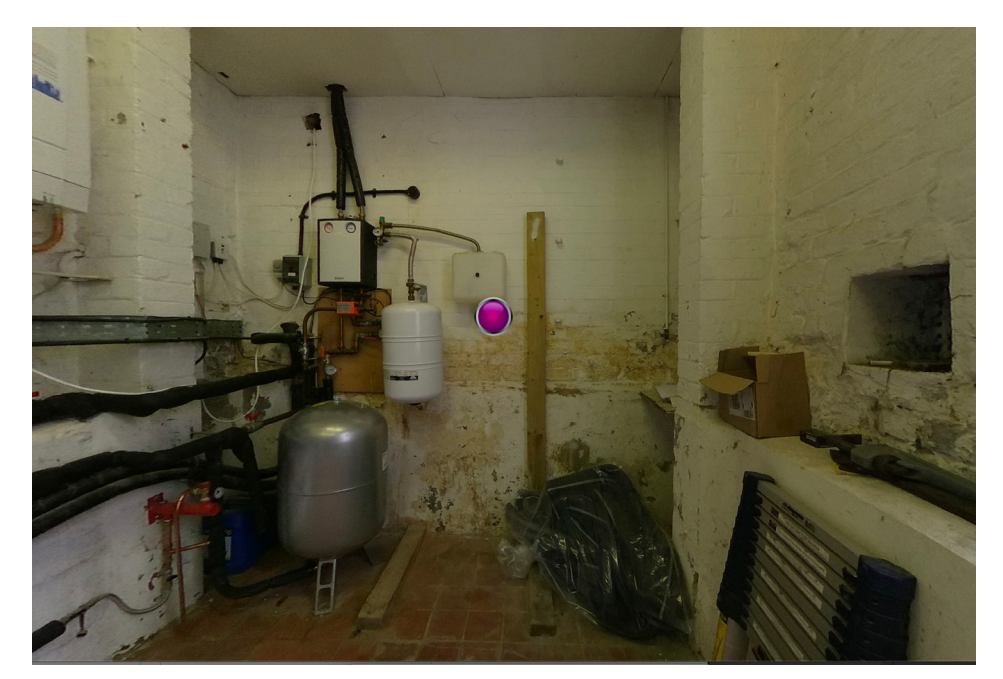
View of house plant room interior