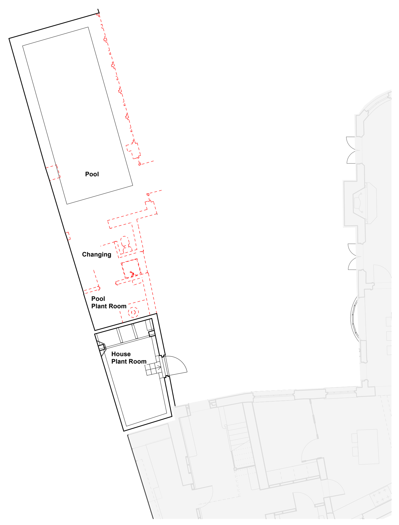
Proposed Demolition Plan