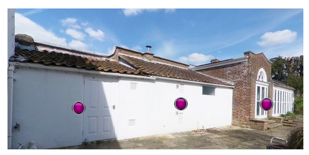
View of plant room roof from courtyard

The existing tiled roof is to be replaced with a new zinc clad roof which extends out beyond the plant room to form a new loggia around the courtyard.