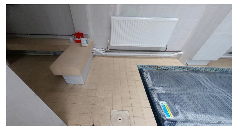
View of pool area showing flooring and wall finishes to be removed

The two roof types are to be removed and replaced with a new flat roof with rooflights and a parapet.