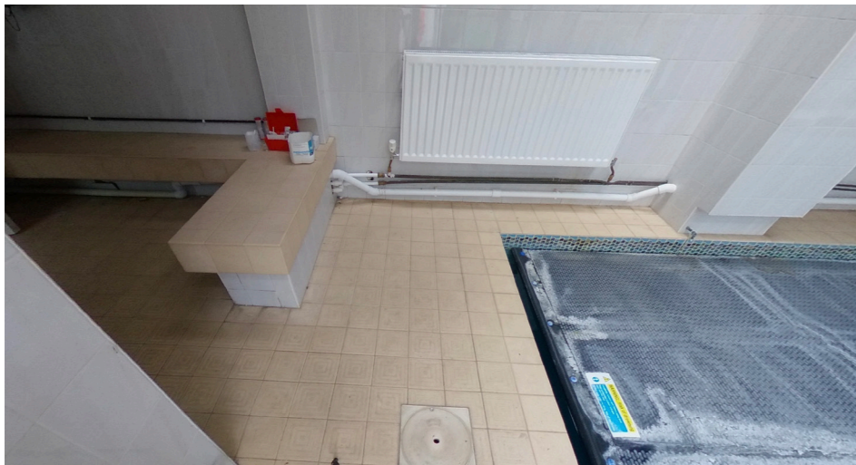
View of pool area showing flooring and wall finishes to be removed

The two roof types are to be removed and replaced with a new flat roof with rooflights and a parapet.