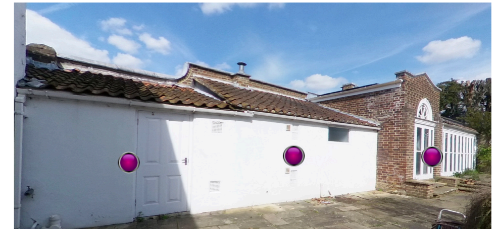
View of plant room roof from courtyard

The existing tiled roof is to be replaced with a new zinc clad roof which extends out beyond the plant room to form a new loggia around the courtyard.