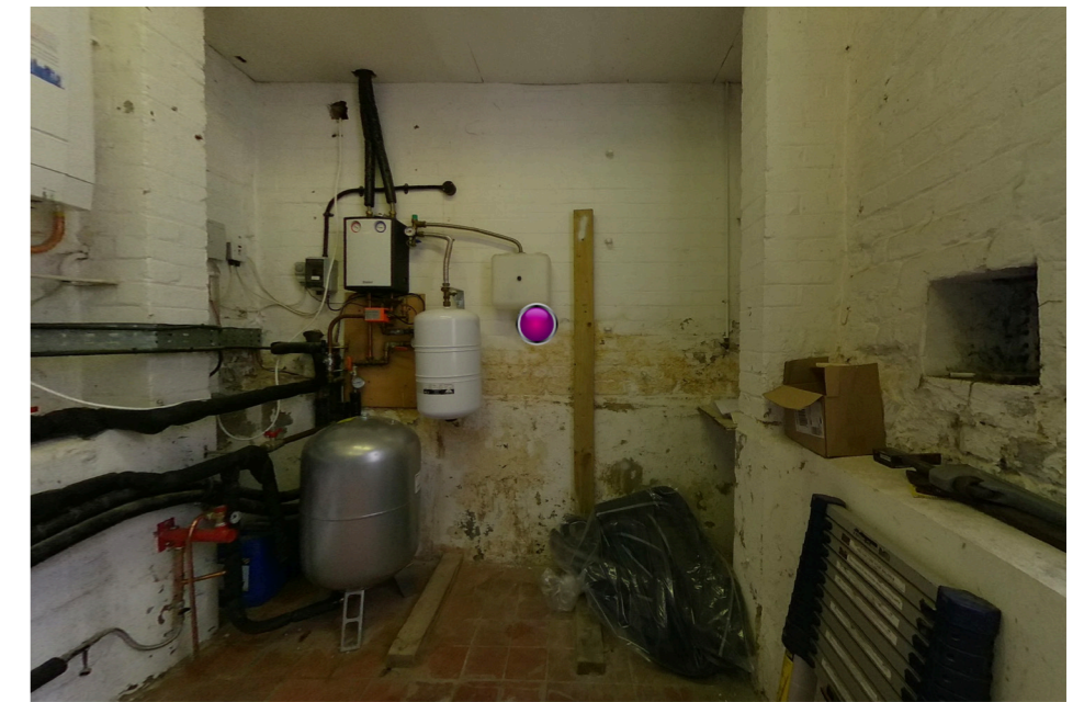
View of house plant room interior