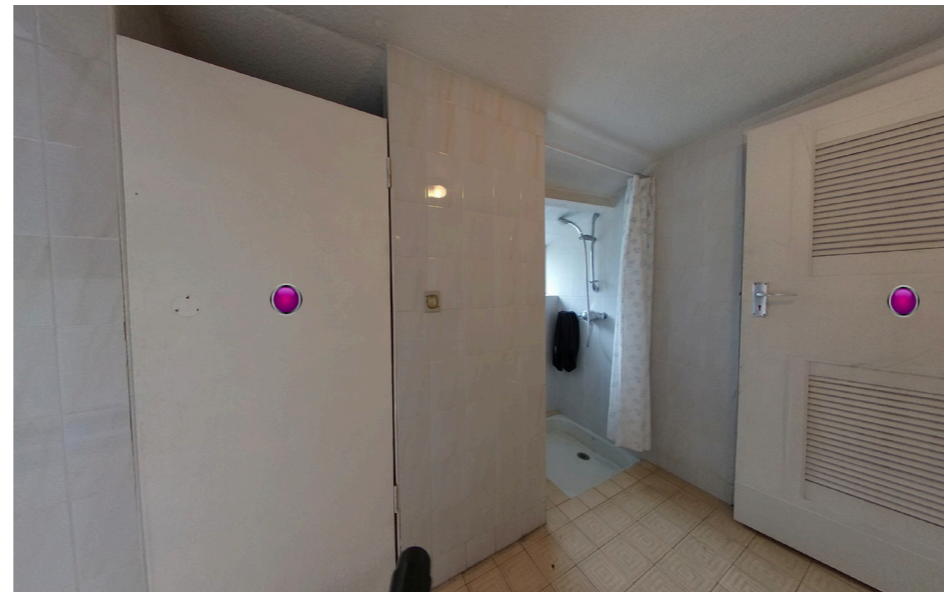
View of changing room interior

The existing external and internal walls are to be removed and replaced in a new configuration as shown in the proposed plans. A new flat roof is to replace the existing tiled roof.