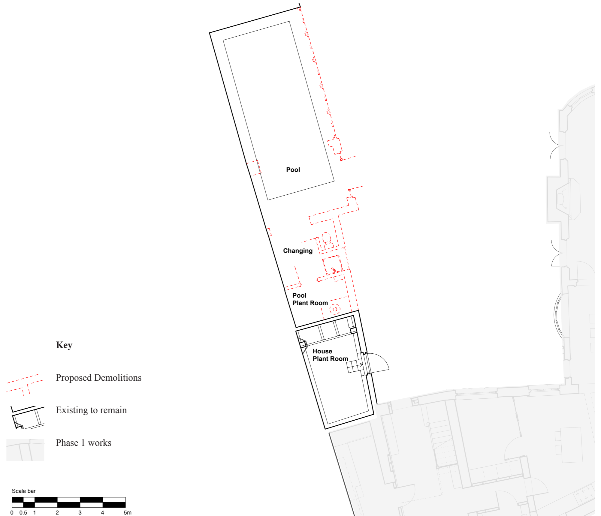
Proposed Demolition Plan

As detailed in the Heritage Assessment Report, the pool wing of the house has 18th century origins but is now entirely 20th century. The adjacent plan shows the proposed demolition works. The following pages will detail the building parts to be demolished and their replacements.