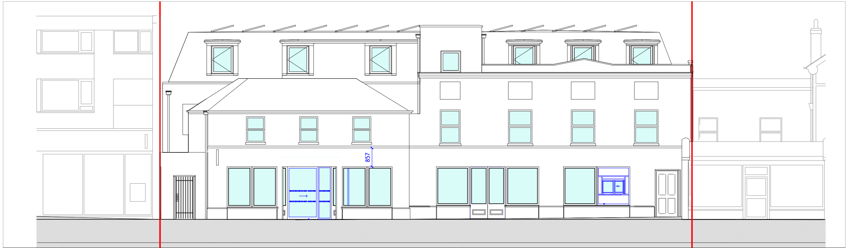
Existing Front Elevation (from South East)