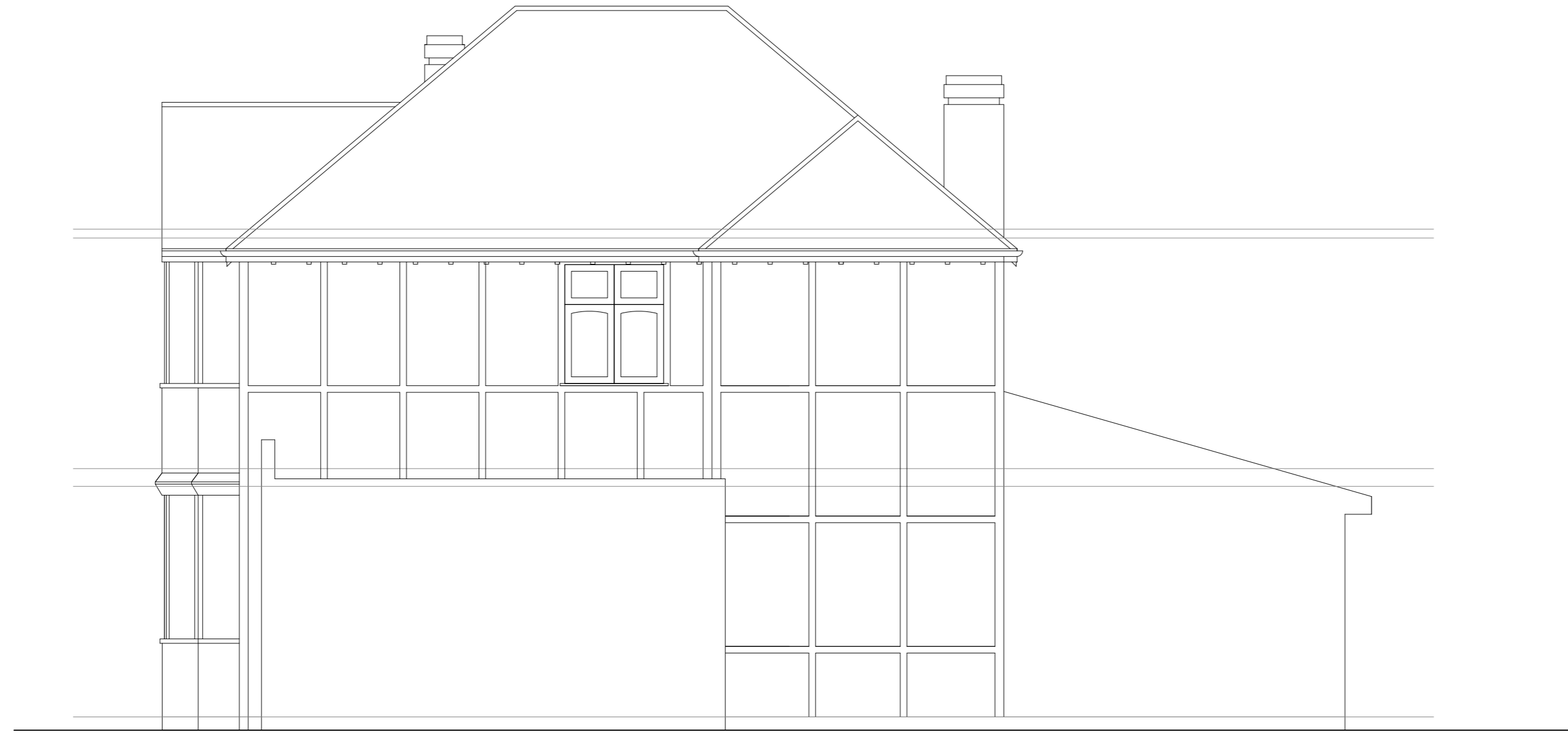
2 EXISTING RIGHT ELEVATION Scale: 1:50