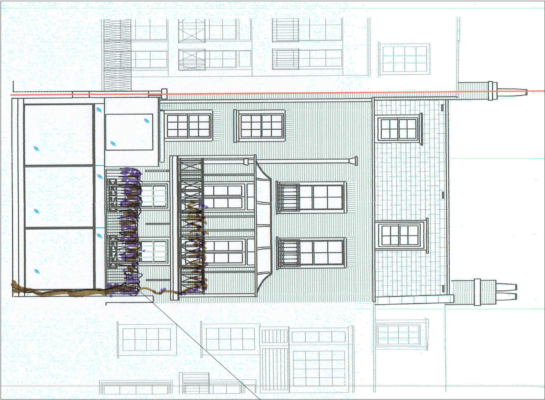
Proposed Rear Elevation - Wisteria Sketch NTS

The images on the left show that Wisteria previously reached from the garden level to the upper ground floor balcony.