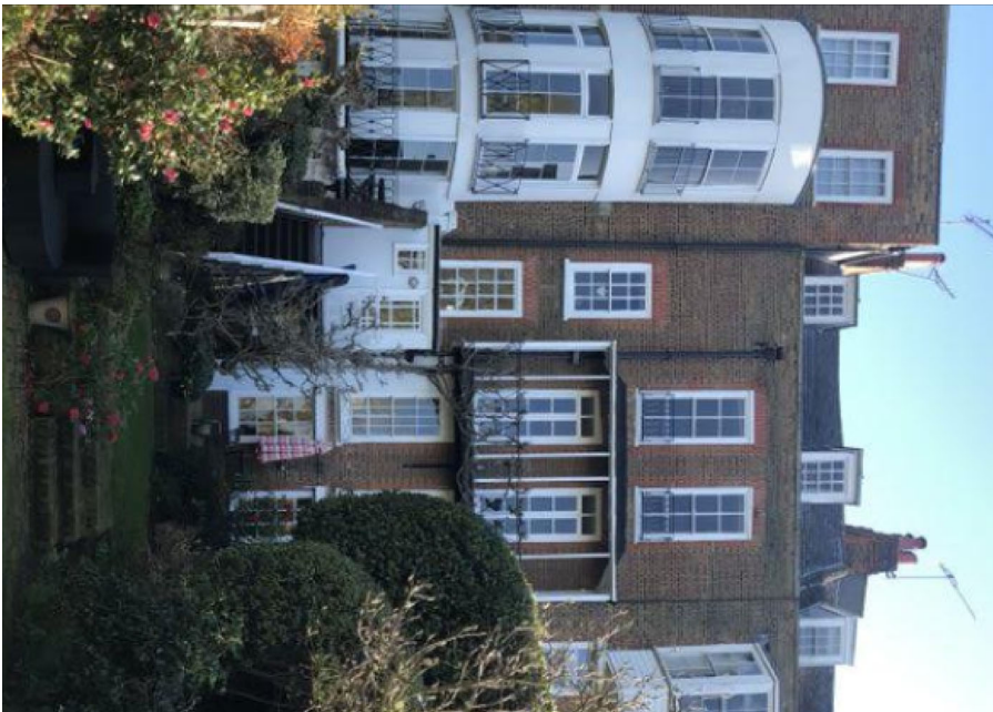
Image 1 - Before repair to upper balcony was required