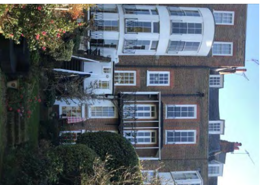
Image 1 - Before repair to upper balcony was required