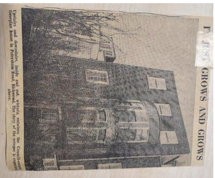
Image 2 - Extract from newspaper circa 1970's