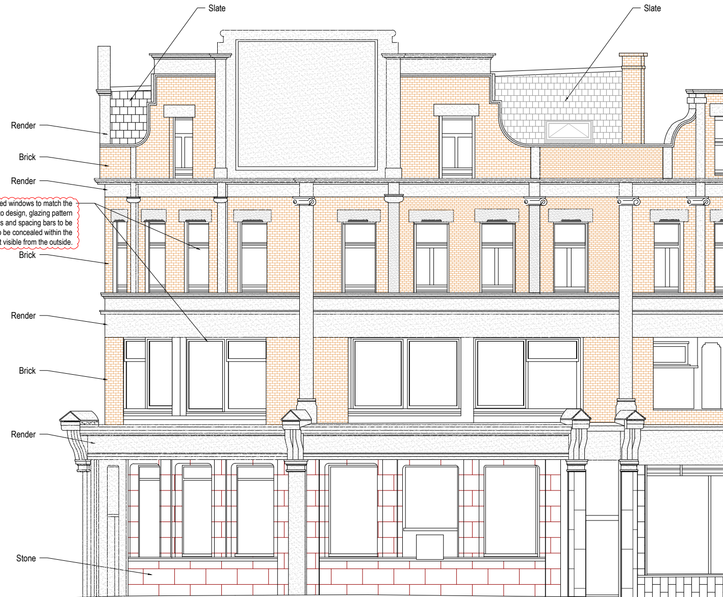
PROPOSED SIDE ELEVATION (RIGHT ELEVATION)