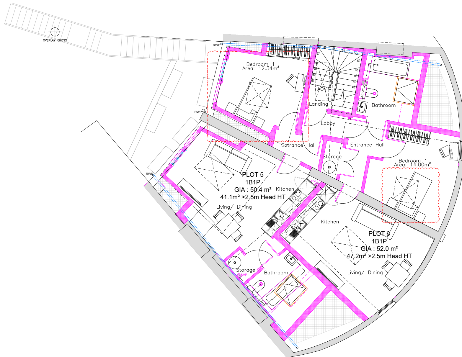
PROPOSED 3RD FLOOR PLAN 1:100

Ordnance Survey, (c) Crown Copyright 2024. All rights reserved. Licence number 100022432