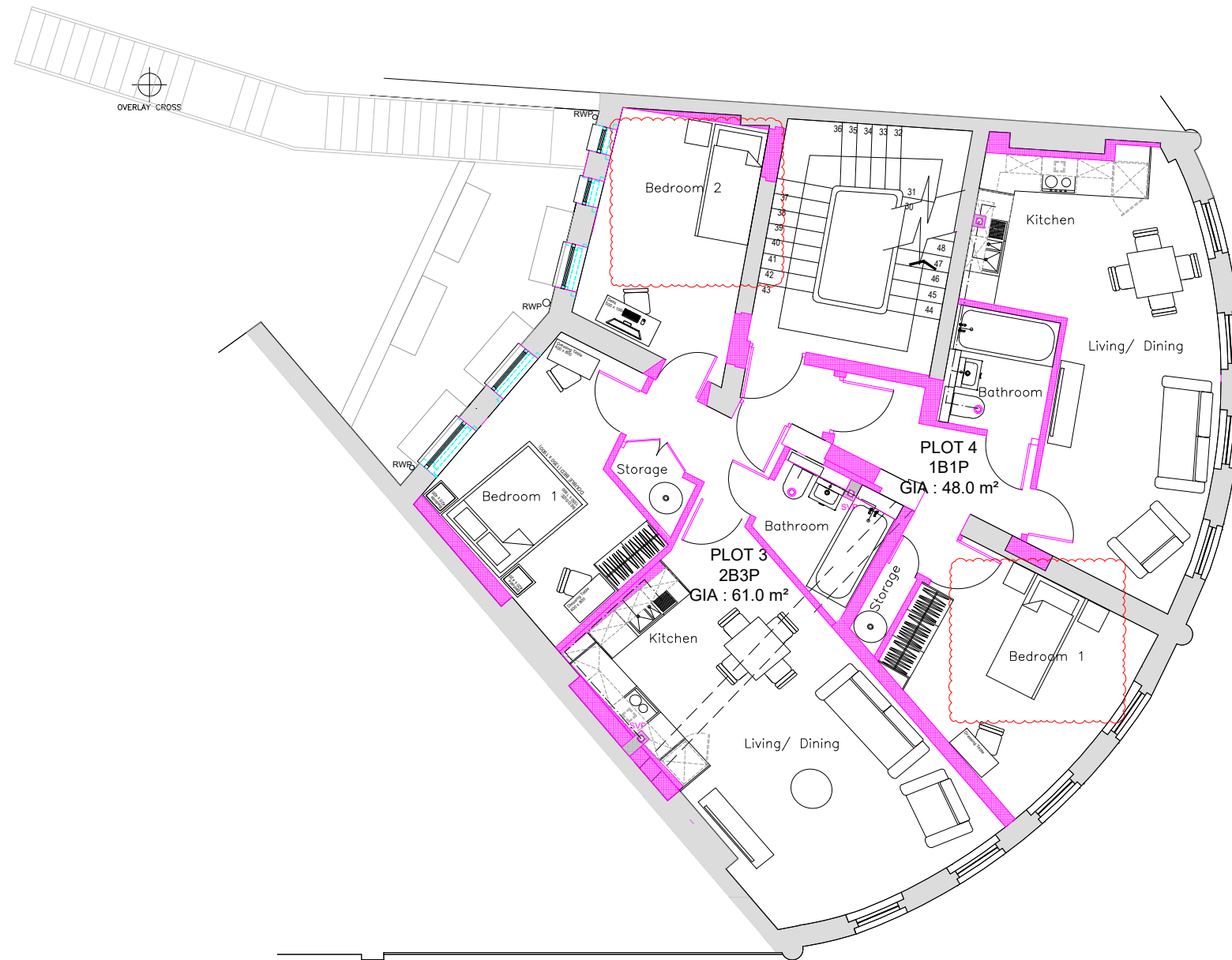
PROPOSED 2ND FLOOR PLAN 1 : 100

Ordnance Survey, (c) Crown Copyright 2024. All rights reserved. Licence number 100022432