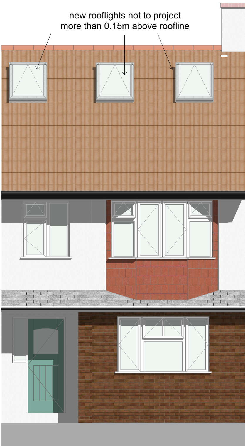
E-01 E-01 Elevation 1:50