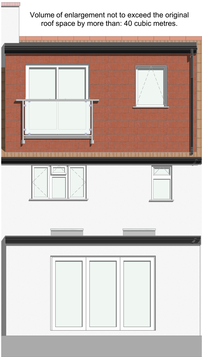
E-02 E-02 Elevation 1:50