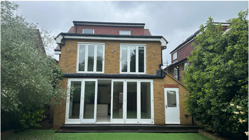
CURRENT SITUATION - GARDEN VIEW