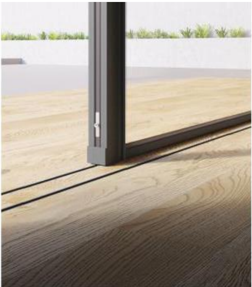
Sky frame windows - Example