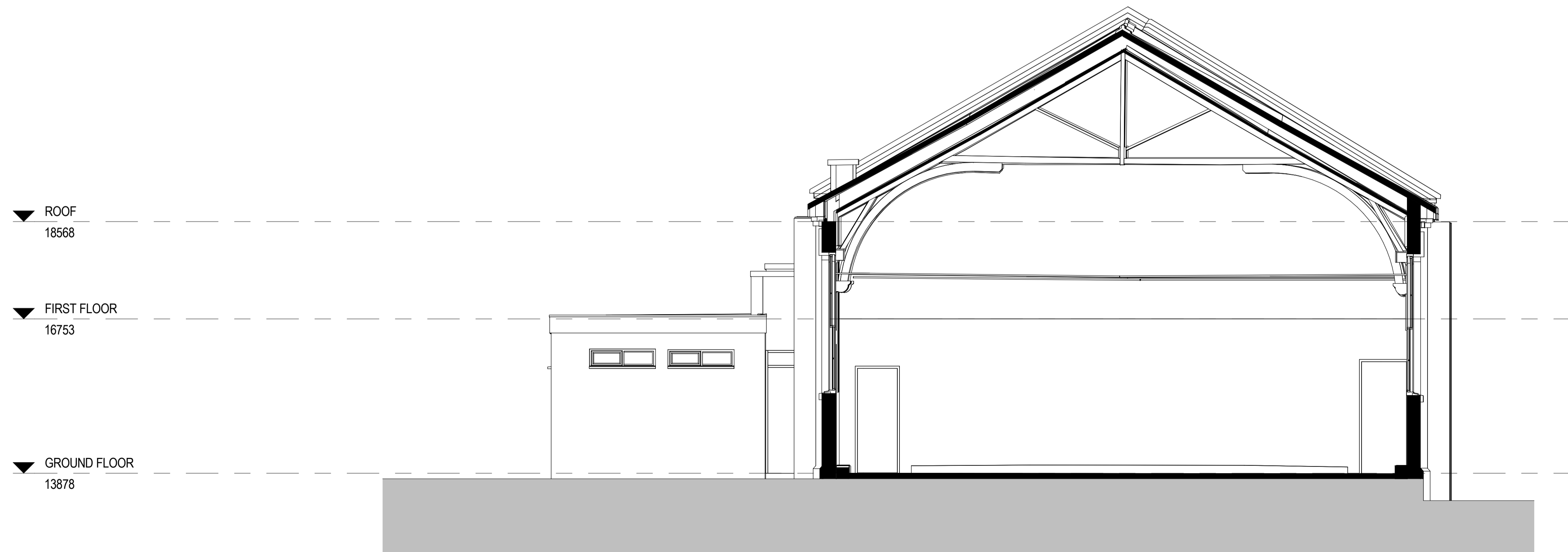
2 SHORT SECTION BB - EXISTING 1 : 50