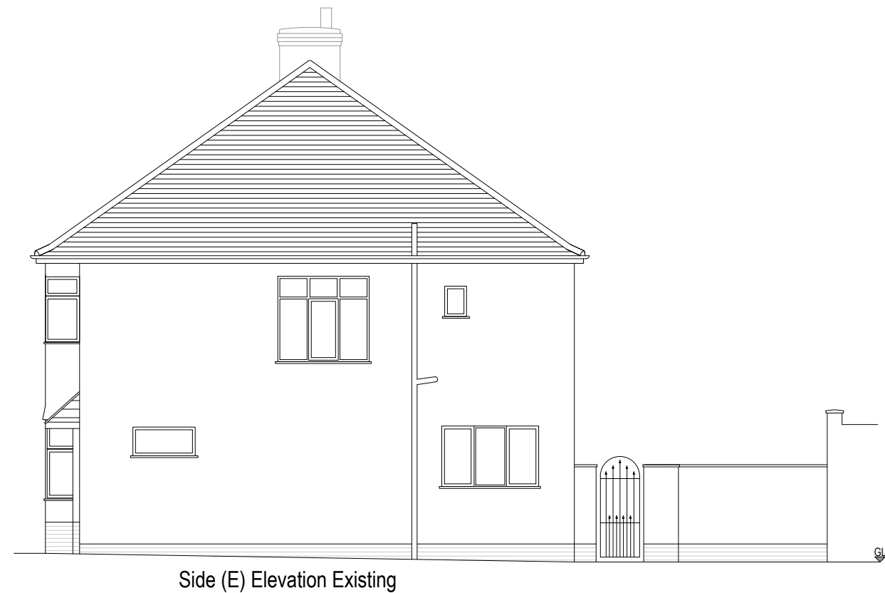
Side (E) Elevation Existing