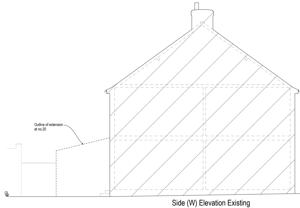
Side (W) Elevation Existing

These drawings are for planning application purposes only. Main contractor to verify dimensions on site. Boundary (Assumed) -----