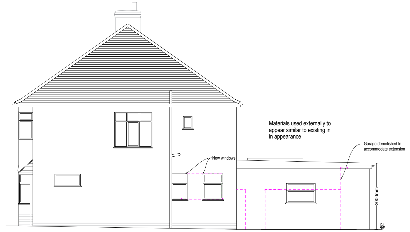
Side (E) Elevation Proposed