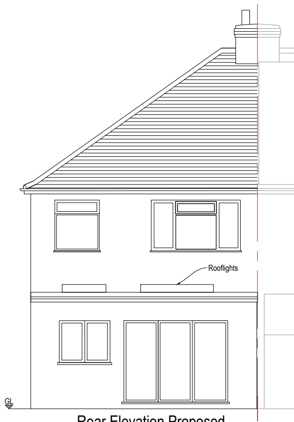
Rear Elevation Proposed