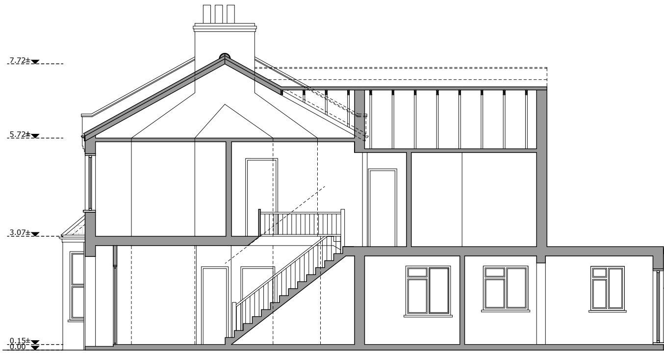
EXISTING SECTION AA