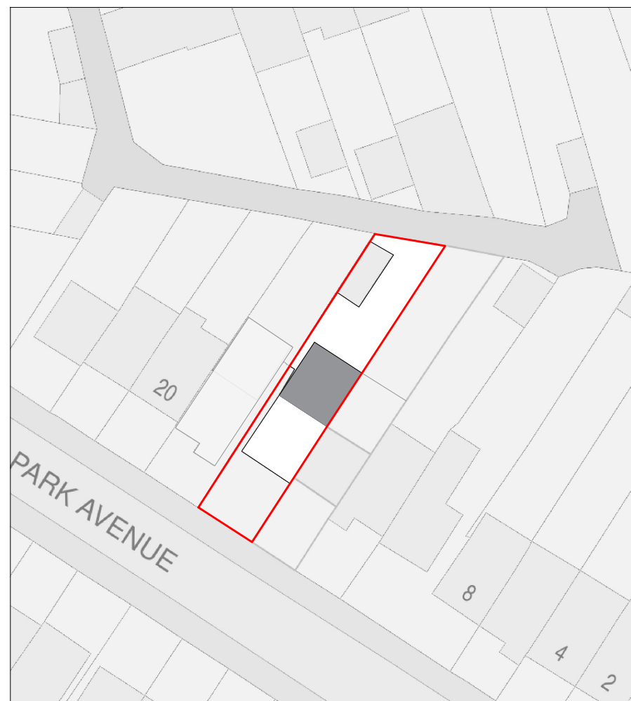
SITE PLAN Scale 1:500