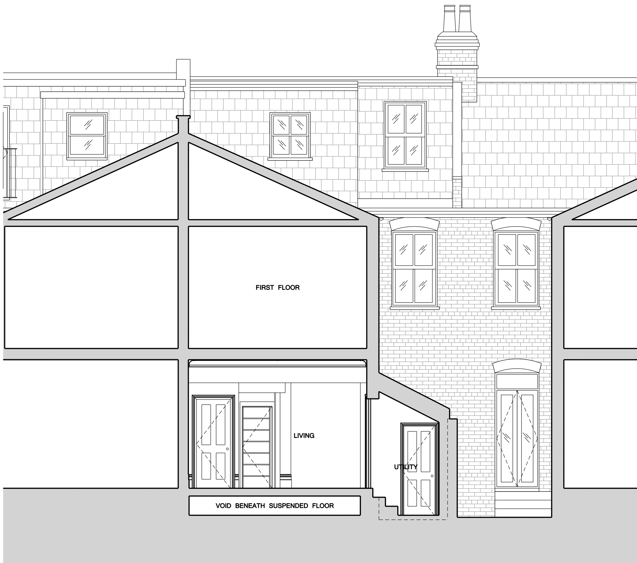
Existing X3 Section