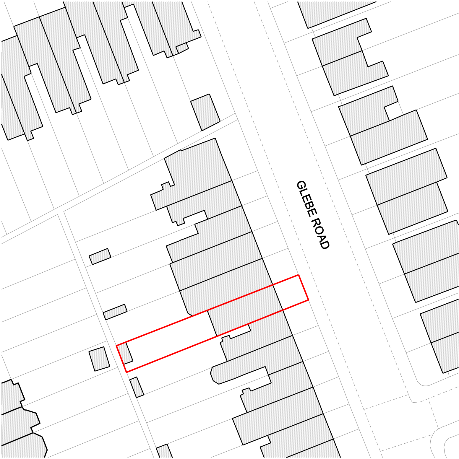
EXISTING SITE LOCATION PLAN 1:500

* This drawing is Copyright © McLaren Excell Ltd.