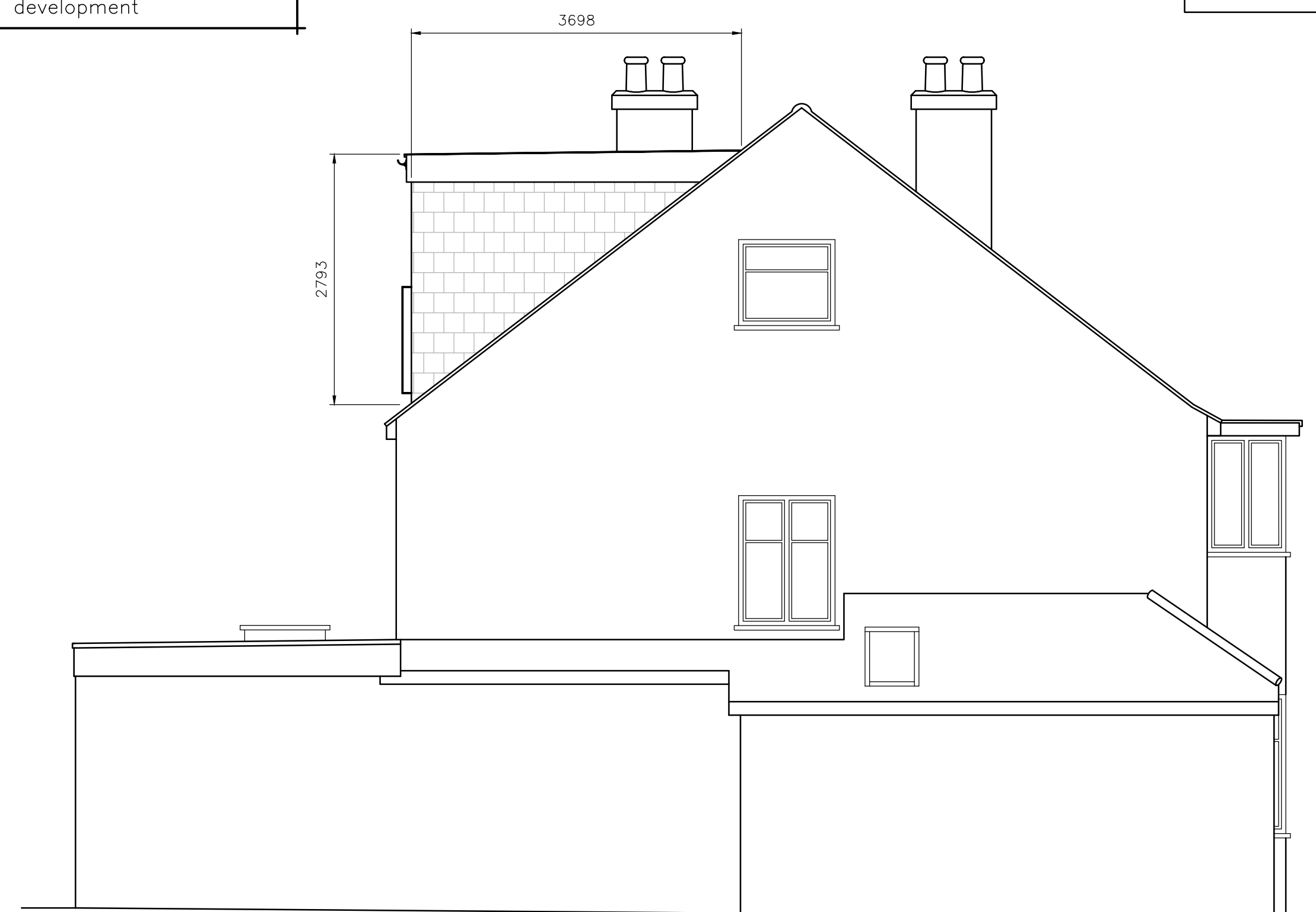
PROPOSED SIDE ELEVATION 1:50