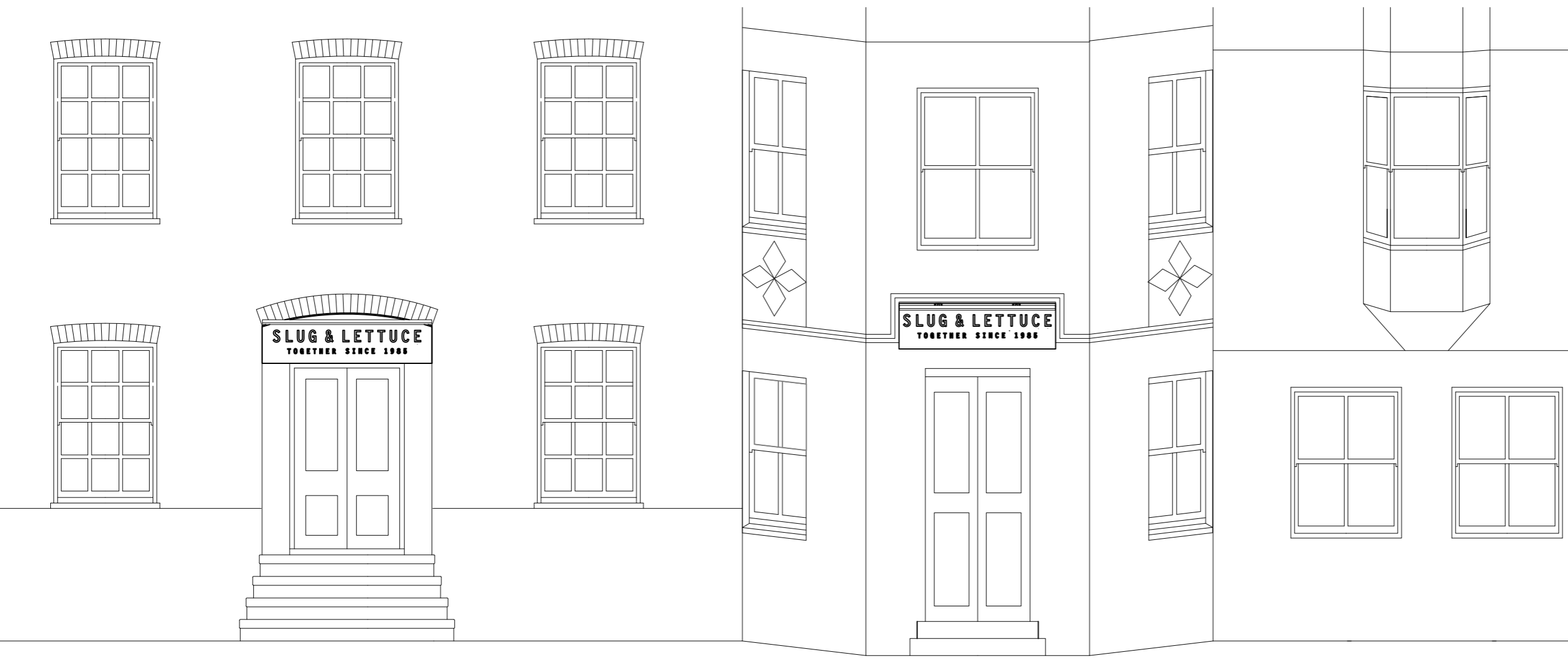
Front Elevation Scale 1:50