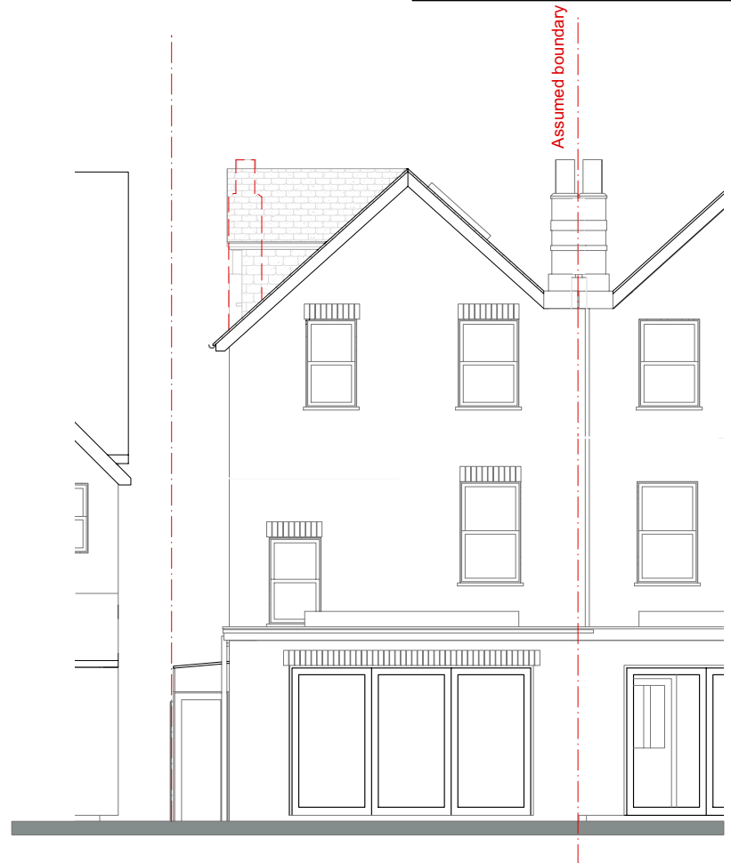
2 Rear Elevation proposed Scale: 1:100