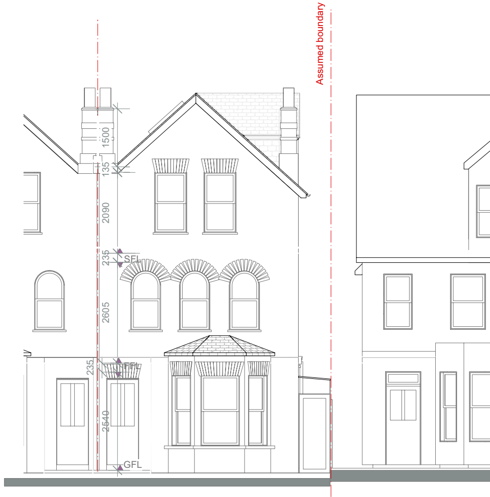
1 Front ele proposed Scale: 1:100

GENERAL NOTES: Do not scale from this drawing. Dimensions must be checked on site. This drawing is copyright of Grainne O'Keeffe Architects. This drawing cannot be copied or used in any way without the express permission of Grainne O'Keeffe Architects. Neighbouring properties not surveyed unless stated