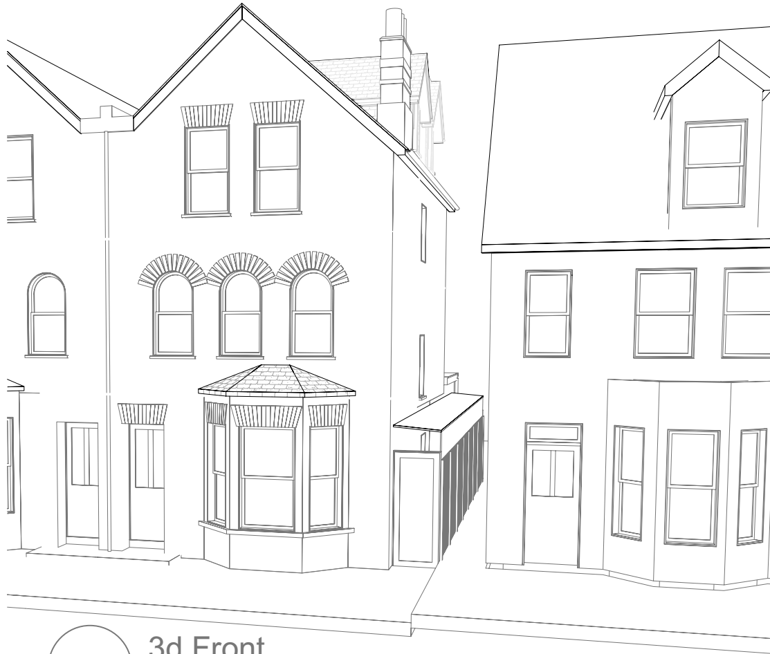
1 3d Front Scale: 1:100

GENERAL NOTES: Do not scale from this drawing. Dimensions must be checked on site. This drawing is copyright of Grainne O'Keeffe Architects. This drawing cannot be copied or used in any way without the express permission of Grainne O'Keeffe Architects. Neighbouring properties not surveyed unless stated