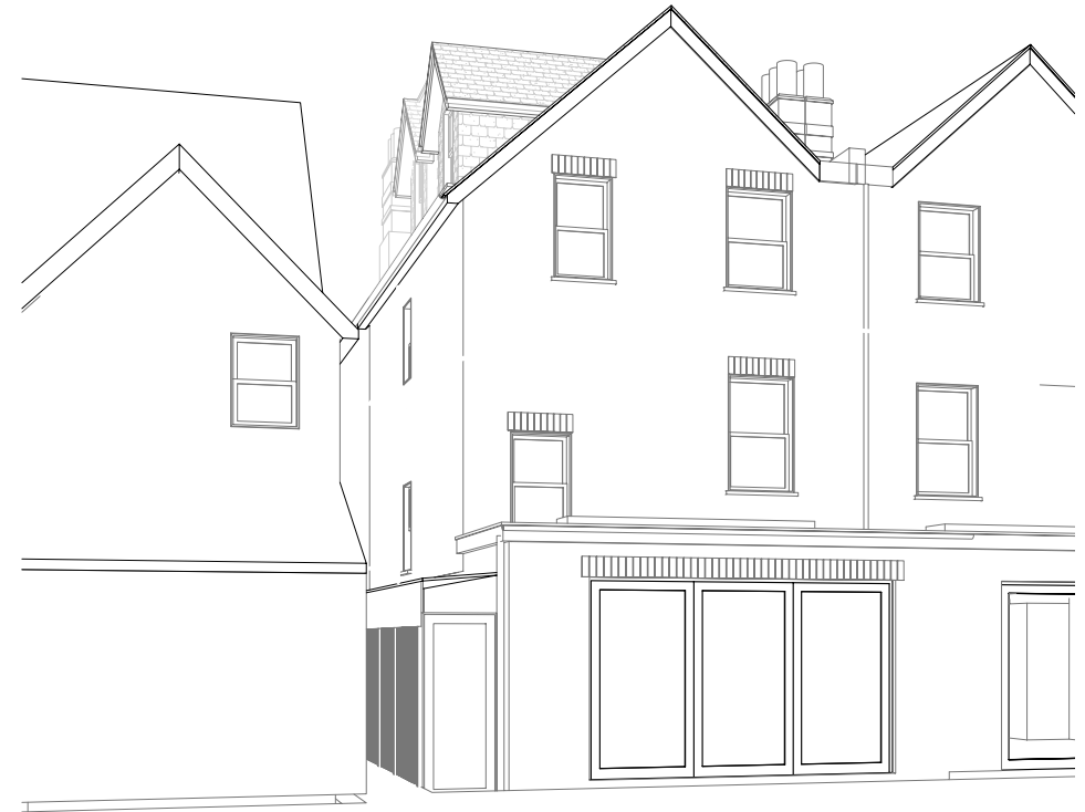
2 3d Rear