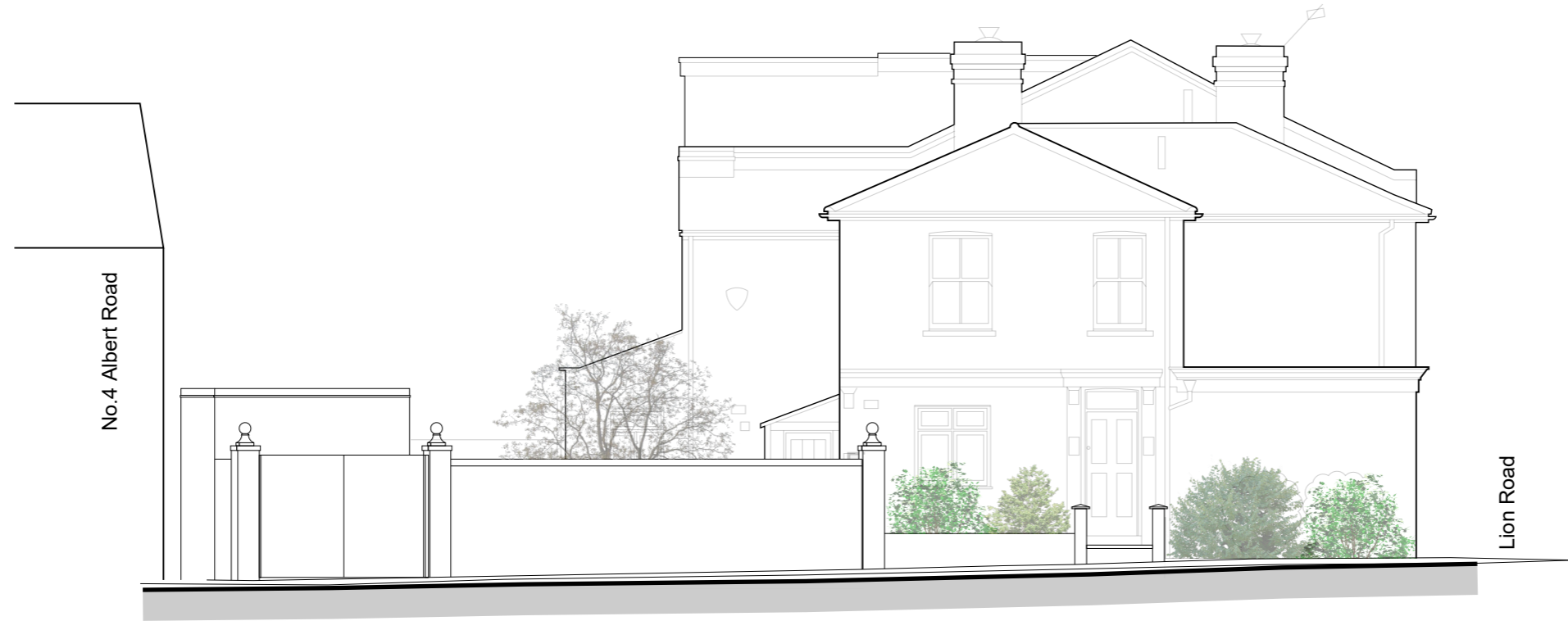
EXISTING STREET (WEST) ELEVATION