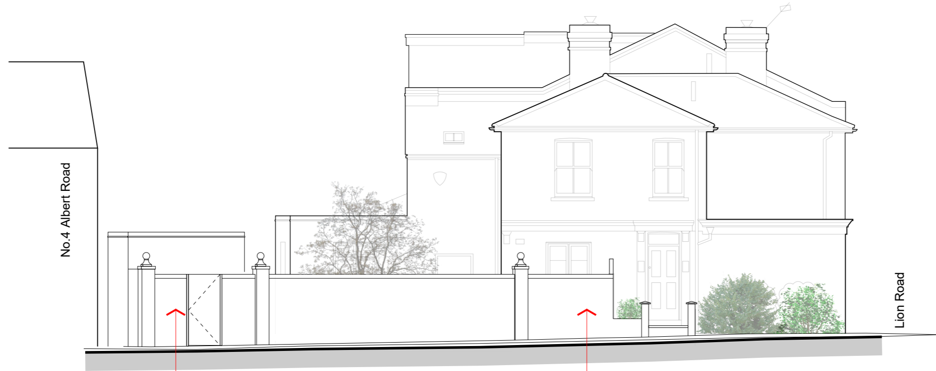
PROPOSED STREET (WEST) ELEVATION

EXISTING TIMBER GATES REMOVED AND REPLACED WITH NEW TIMBER ACCESS GATE AND BRICK WALLS EITHER SIDE. BRICKWORK TO MATCH EXISTING WITH BRICK ON EDGE CAPPING