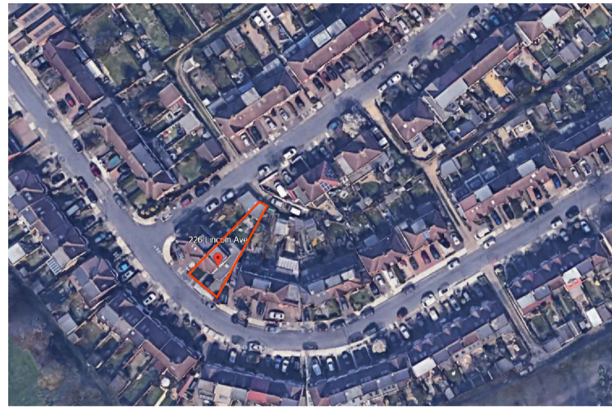
Site Aerial View Not to scale