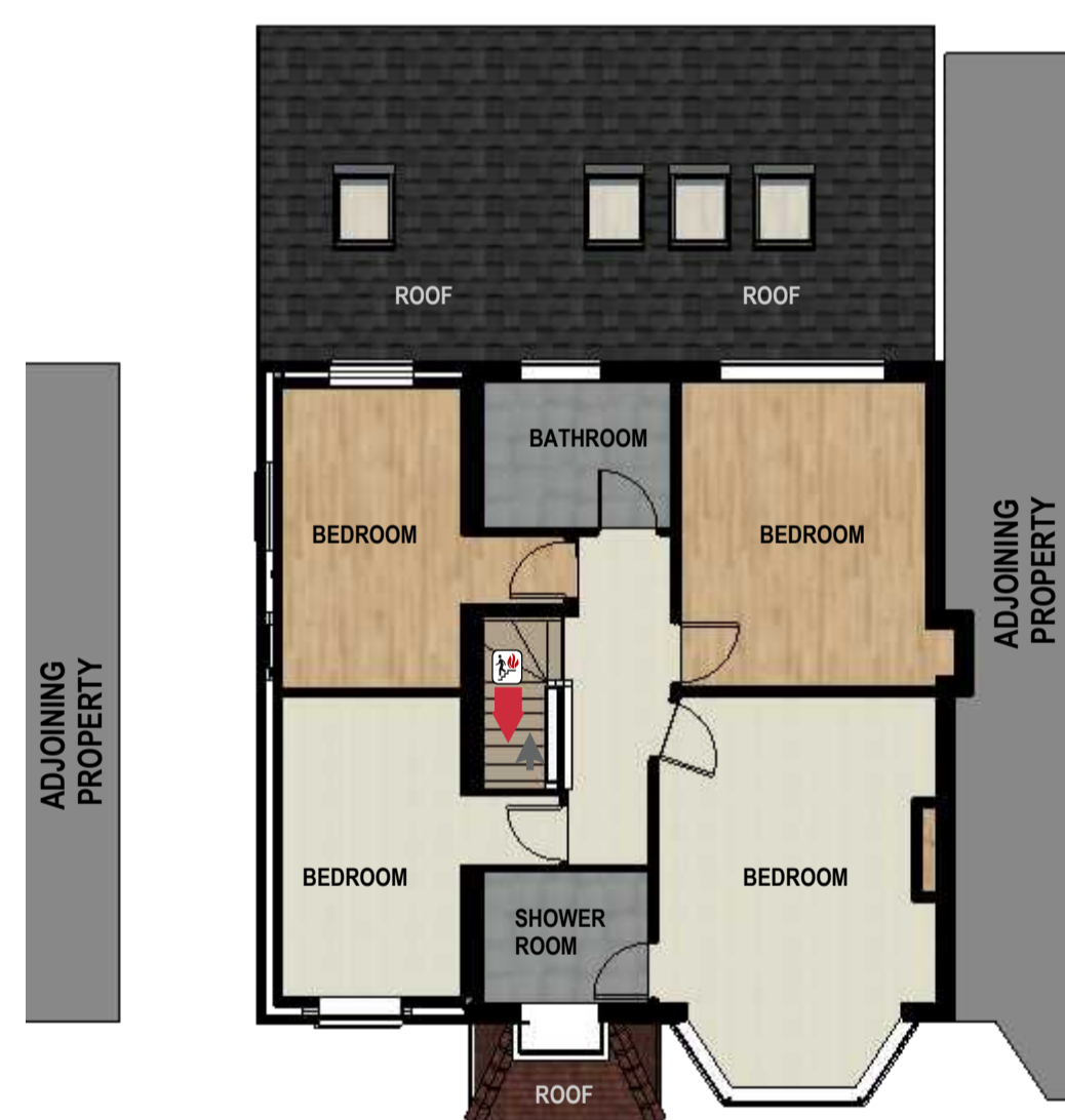
A 01 EXISTING FIRST FLOOR PLAN scale: 1:100