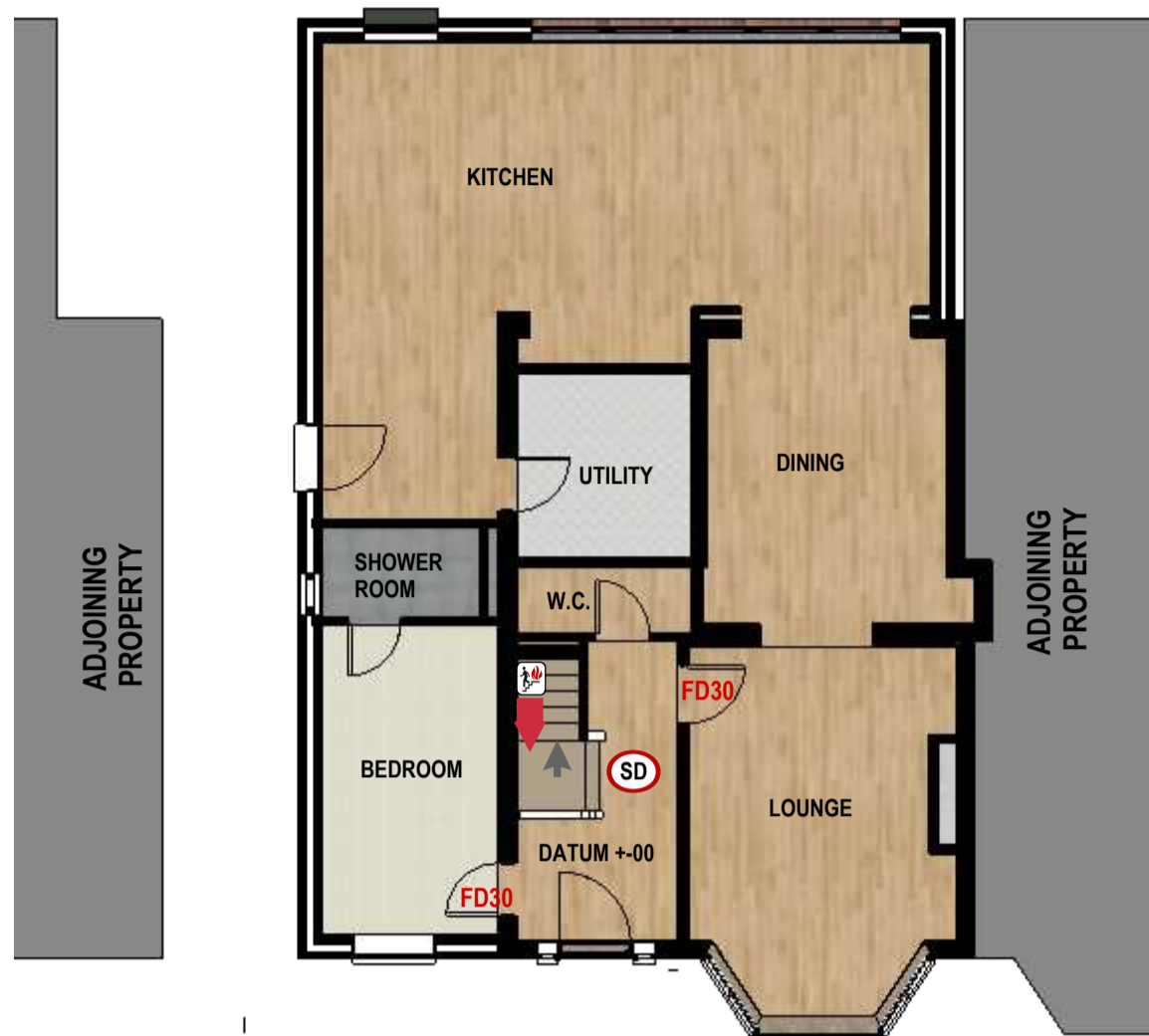
A 01 PROPOSED GROUND FLOOR PLAN scale: 1:100