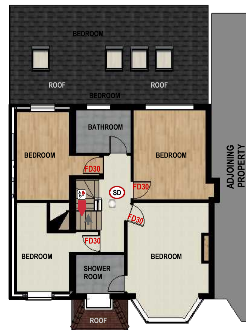
A 01 PROPOSED FIRST FLOOR PLAN scale: 1:100