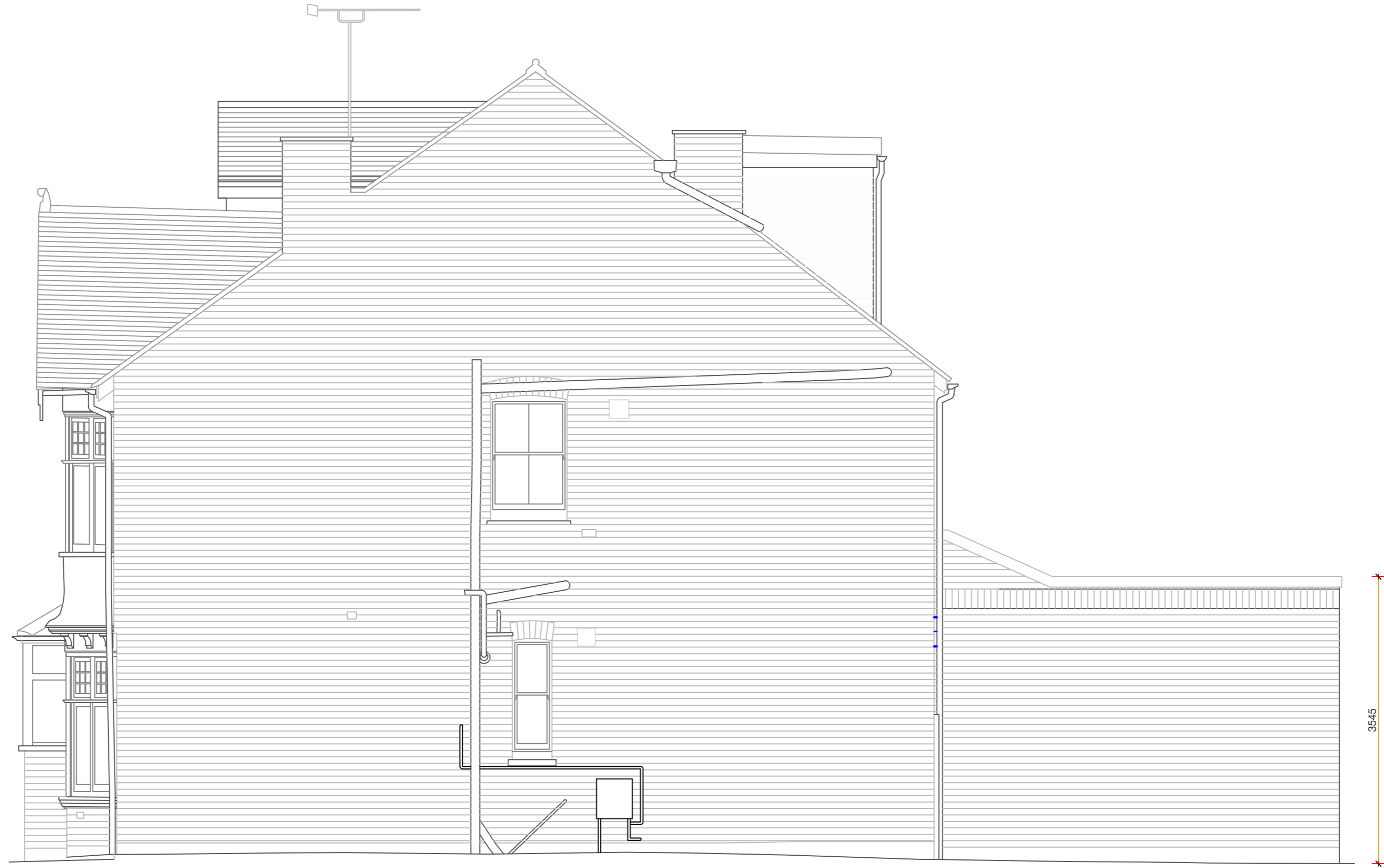
PROPOSED FLANK ELEVATION

Contractor to ensure all proposed drainage is in accordance with Part H of the Building Regulations.