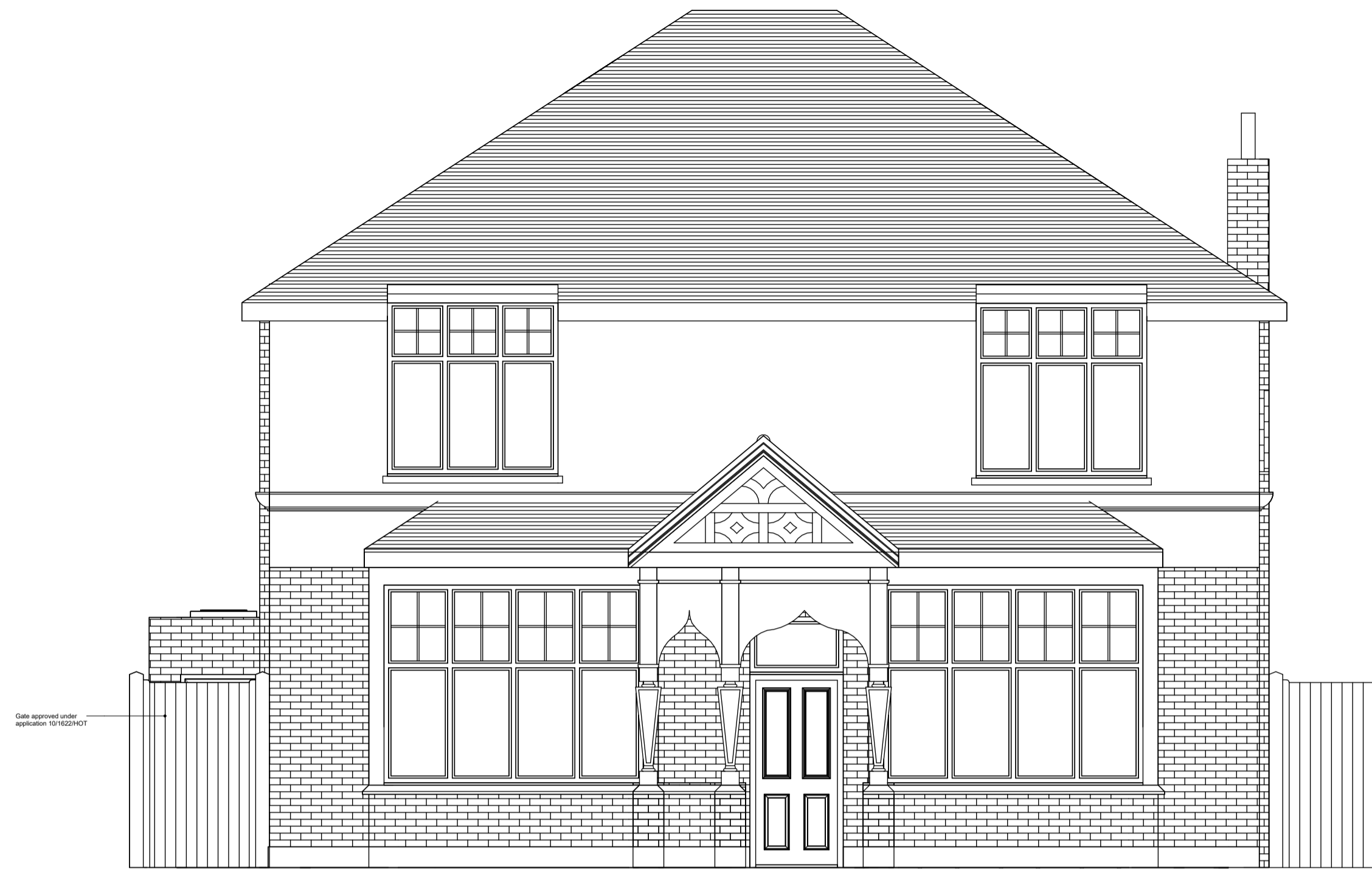
Proposed South Elevation 1 : 50