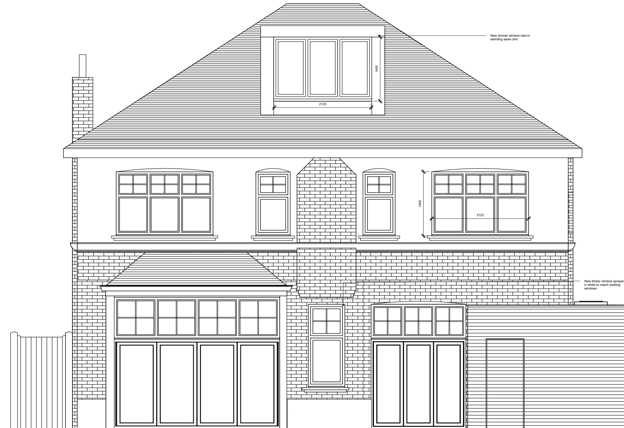
Proposed North Elevation 1 : 50

GENERAL NOTES: This drawing is © SAND architects. Use figured dimensions only. DO NOT SCALE. All dimensions are in millimetres unless noted otherwise. This drawing must be read in conjunction with all other relevant drawings and specifications from the Architect and other consultants. If in doubt, ask. SETTING OUT NOTES: All setting out to be confirmed on site prior to construction - any discrepancy must be immediately reported to the Architect. All partitions set out to studwork or structure. For setting out and specification of M&E services refer to M&E Consultants documents. For setting out and specification of structure refer to Structural Engineer's documents.