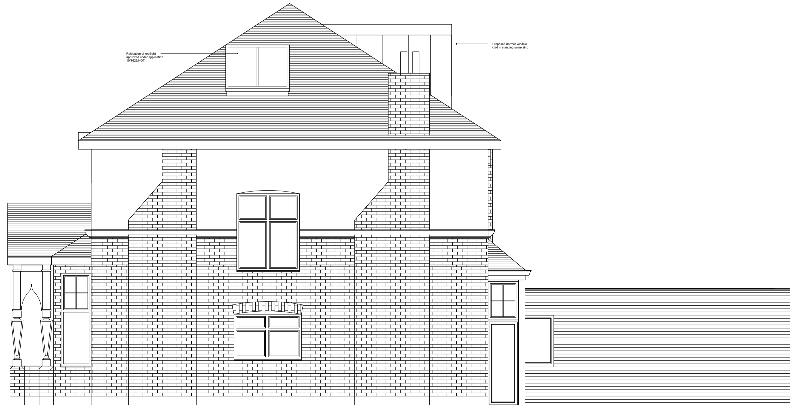
Proposed East Elevation 1 : 50