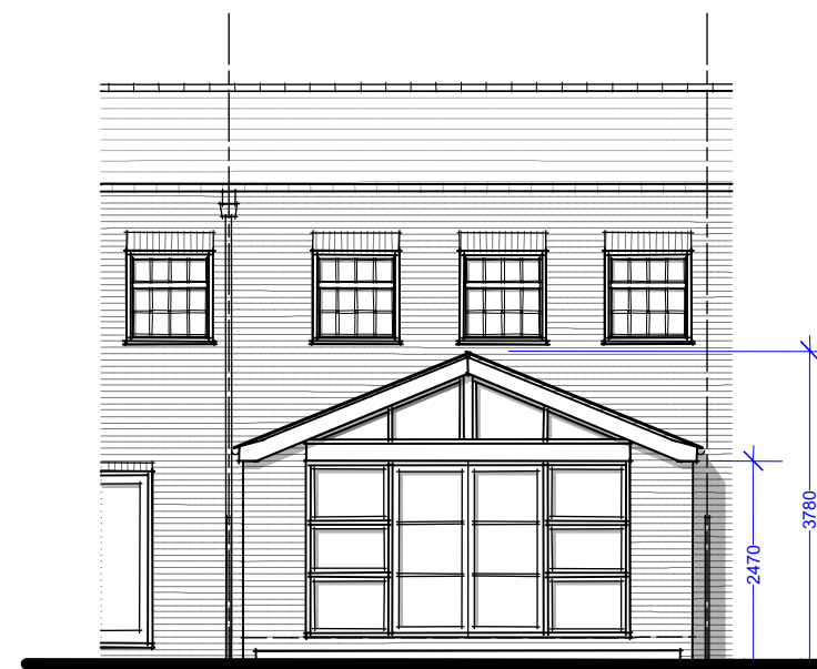
Rear (South) Elevation