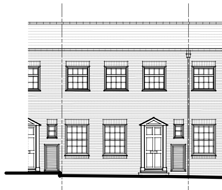
Front (North) Elevation