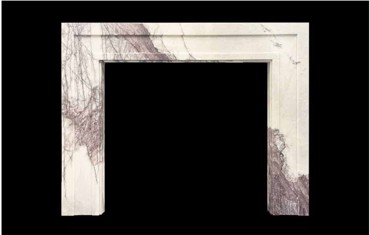
Figure 2 - Contemporary Victorian Fireplace