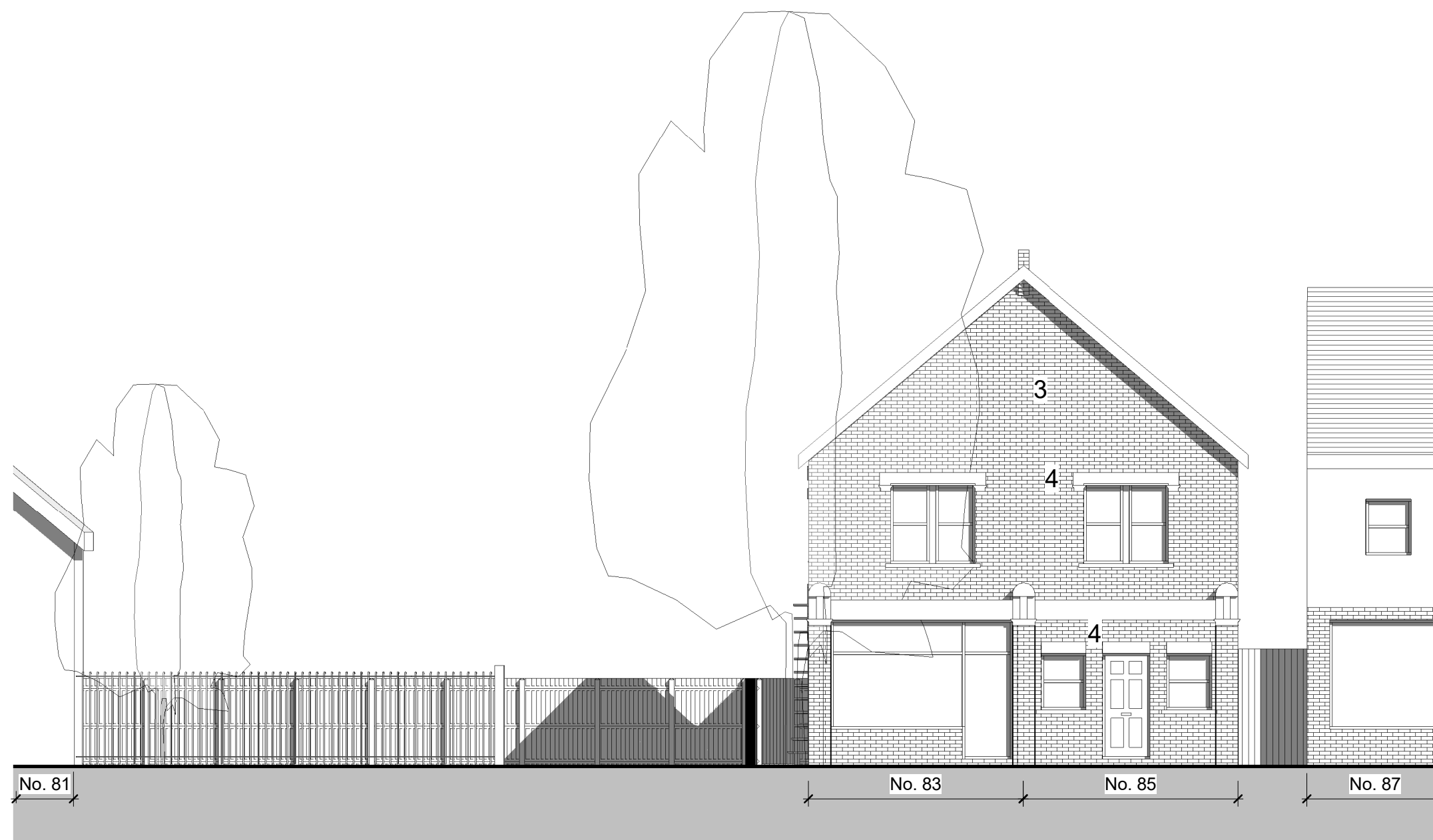
PROPOSED NORTH ELEVATION 1 : 100