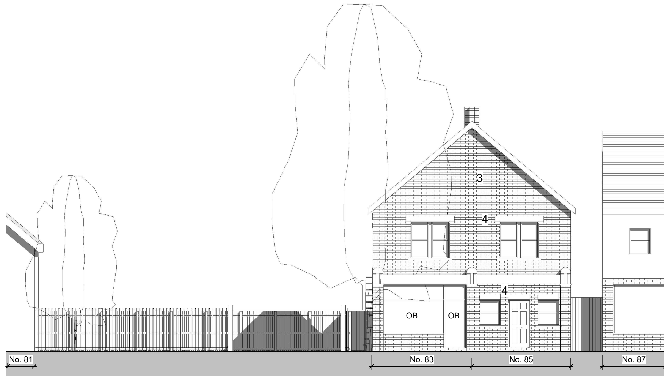
PROPOSED NORTH ELEVATION 1 : 100