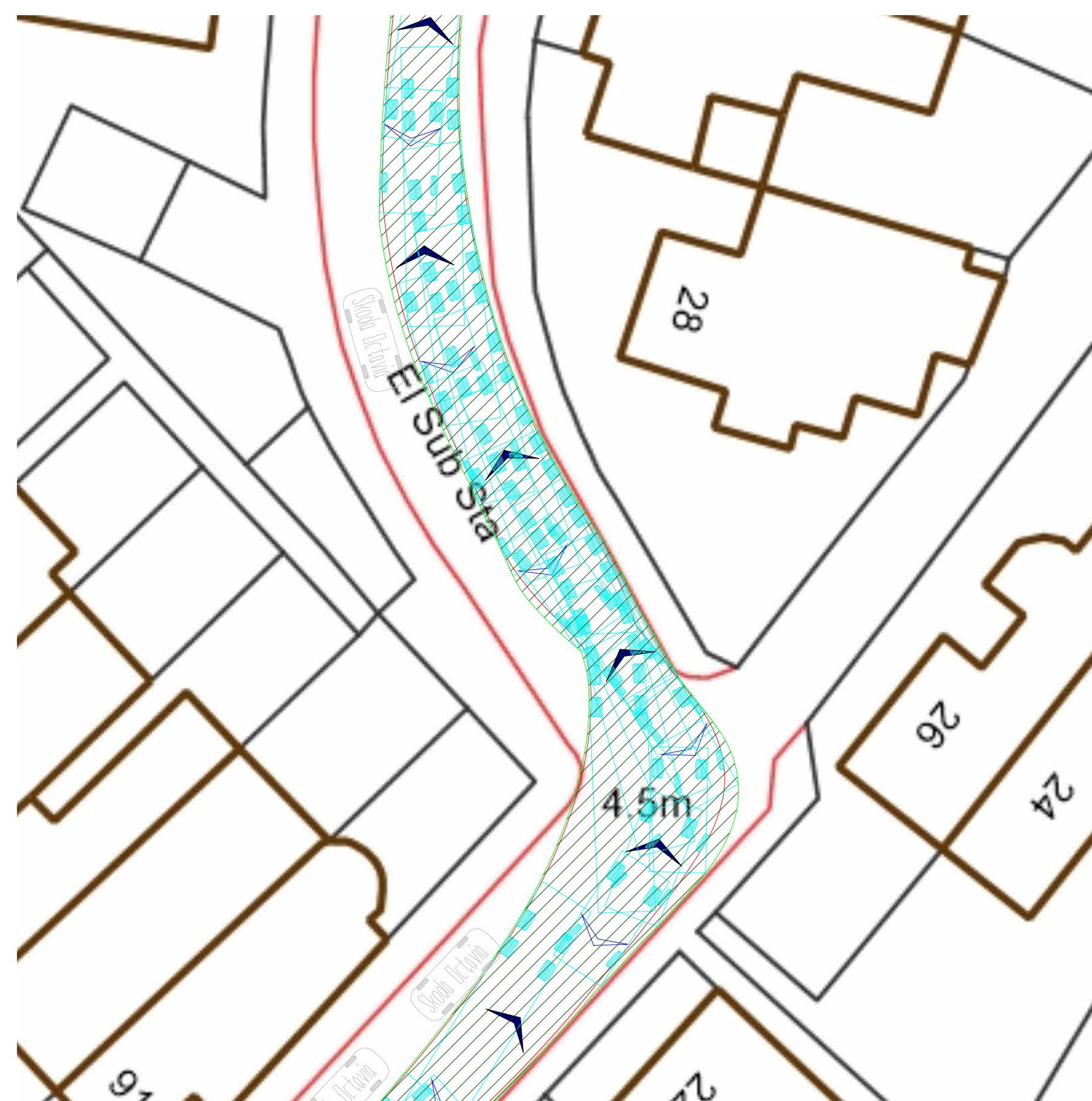
2 Site plan - low loader Detail B 1:200