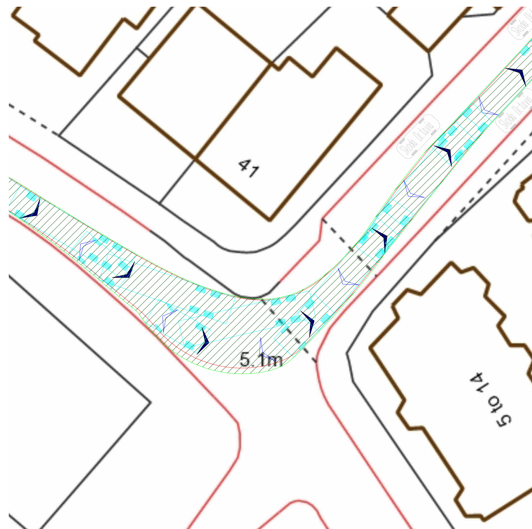
3 Site plan - low loader Detail C 1:200