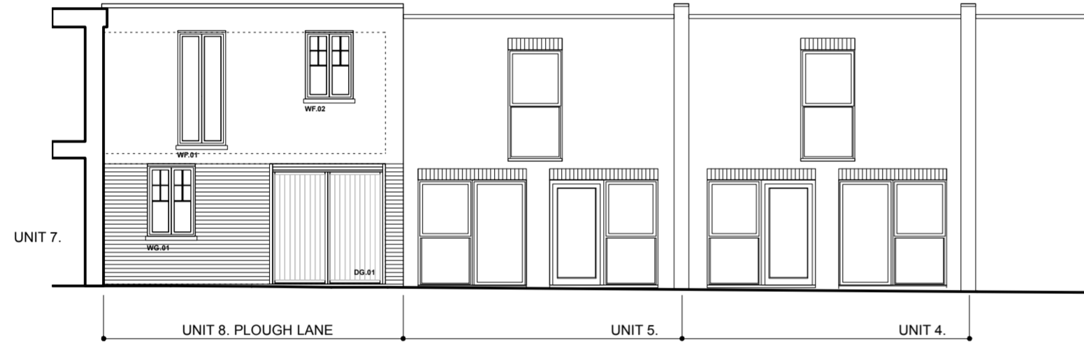
E1 TP01 8 PLOUGH LANE : PLANNING : Existing & Proposed Front Elevation E1 Scale: 1:50