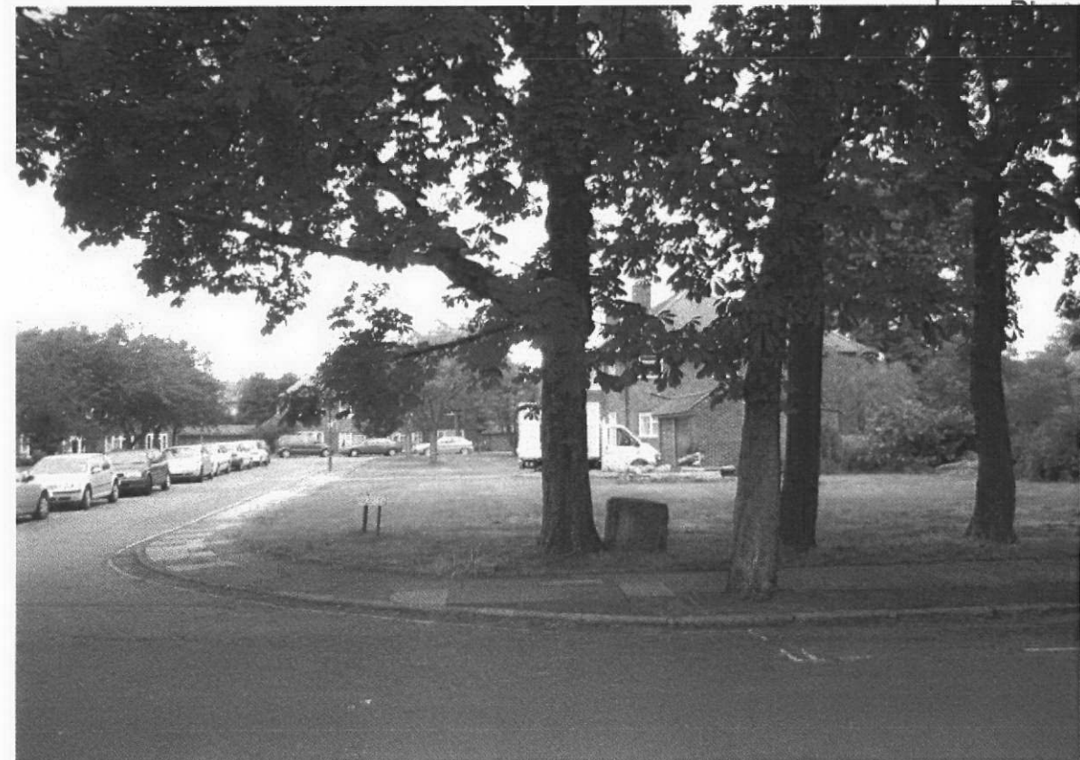
Photo 8: View looking north across Cambridge Park along the westerly margin of the site down Roseleigh Close.

SITE LOCATED AT THE JUNCTION OF ROSELEIGH CLOSE AND CAMBRIDGE PARK, EAST TWICKENHAM, MIDDLESEX TW1