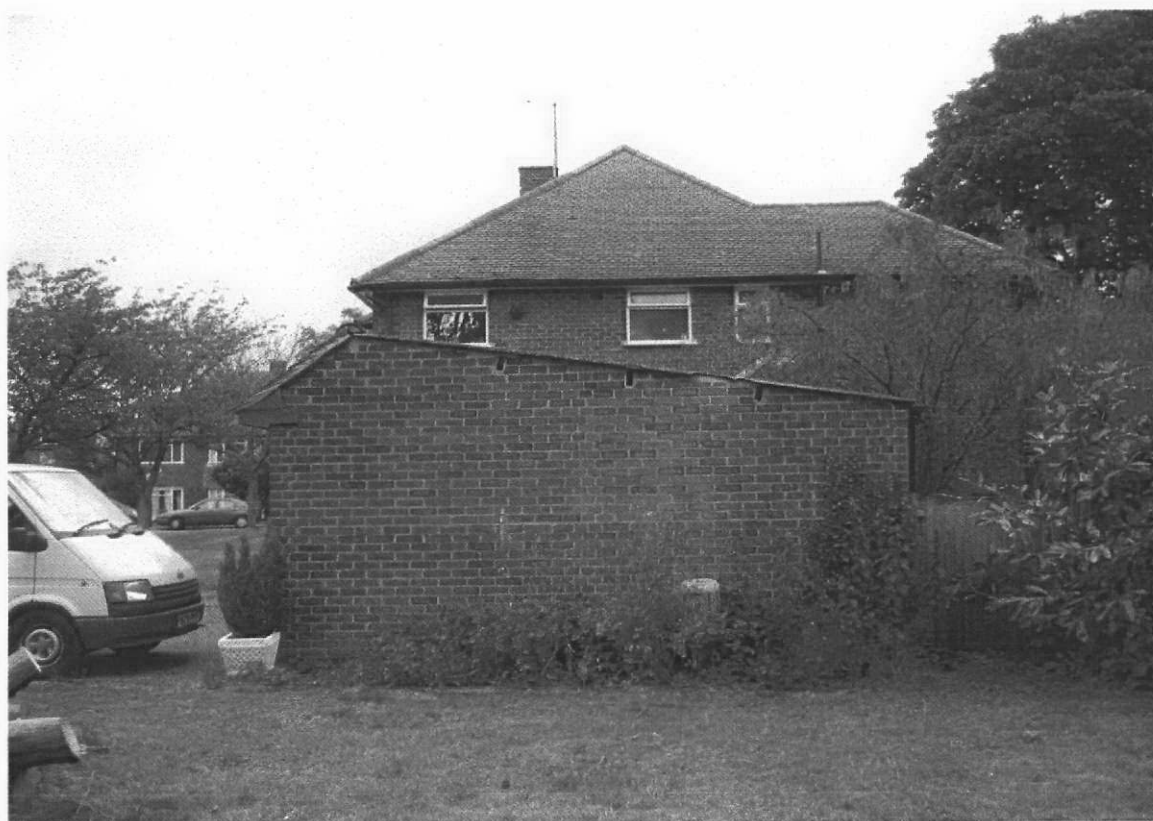
Photo 7: The side elevation to the garage block on the north boundary of the site.

dead end LONDON BOROUGH OF RICHMOND UPON THAMES 27 JUL 2004 PLANNING