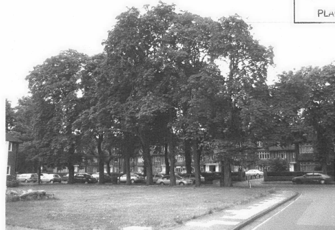
Photo 4: View across the south-west corner area from Roseleigh Close showing the site main characteristics (open margins, corner space, and trees) to be retained.

SITE LOCATED AT THE JUNCTION OF ROSELEIGH CLOSE AND CAMBRIDGE PARK, EAST TWICKENHAM, MIDDLESEX TW1