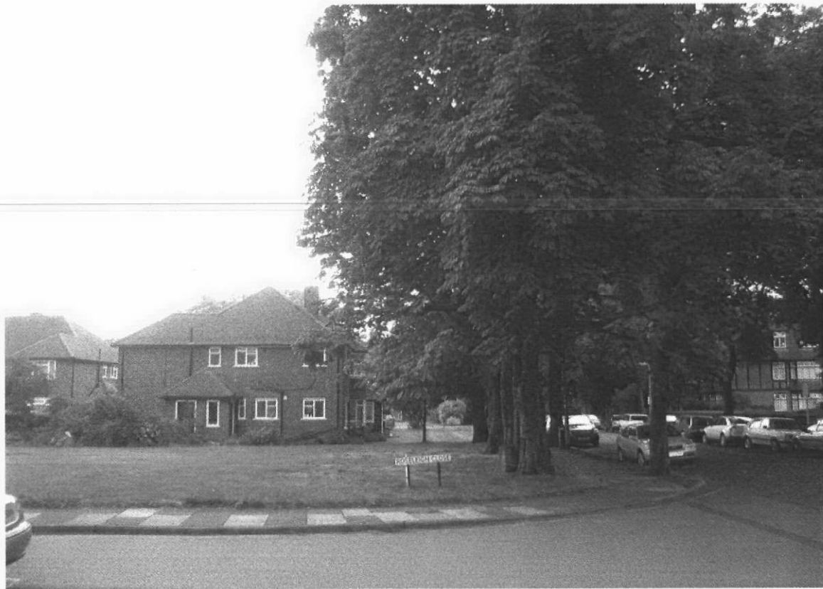
Photo 1: View across Roseleigh Close looking east along the open margin and avenue of chestnuts on the southern boundary with Cambridge Park.