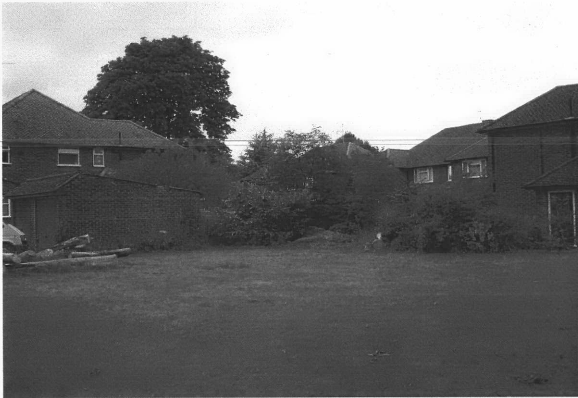
Photo 5: View looking towards the rear north-east corner area of the site proposed for infill development.