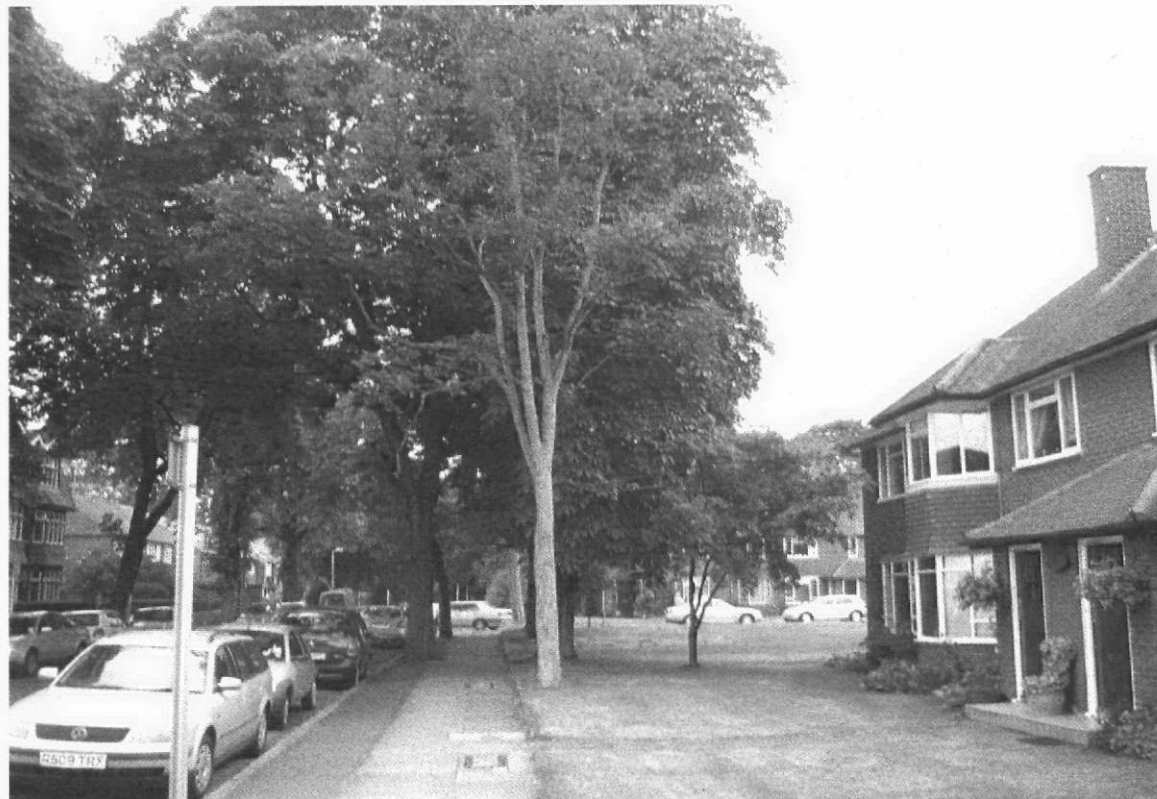
Photo 3: View looking west along Cambridge Park showing avenue of trees, open grassed margin and maisonette block (34 Cambridge Park) to right.

LONDON BOROUGH OF RICHMOND UPON THAMES 27 JUL 2004 PLANNING