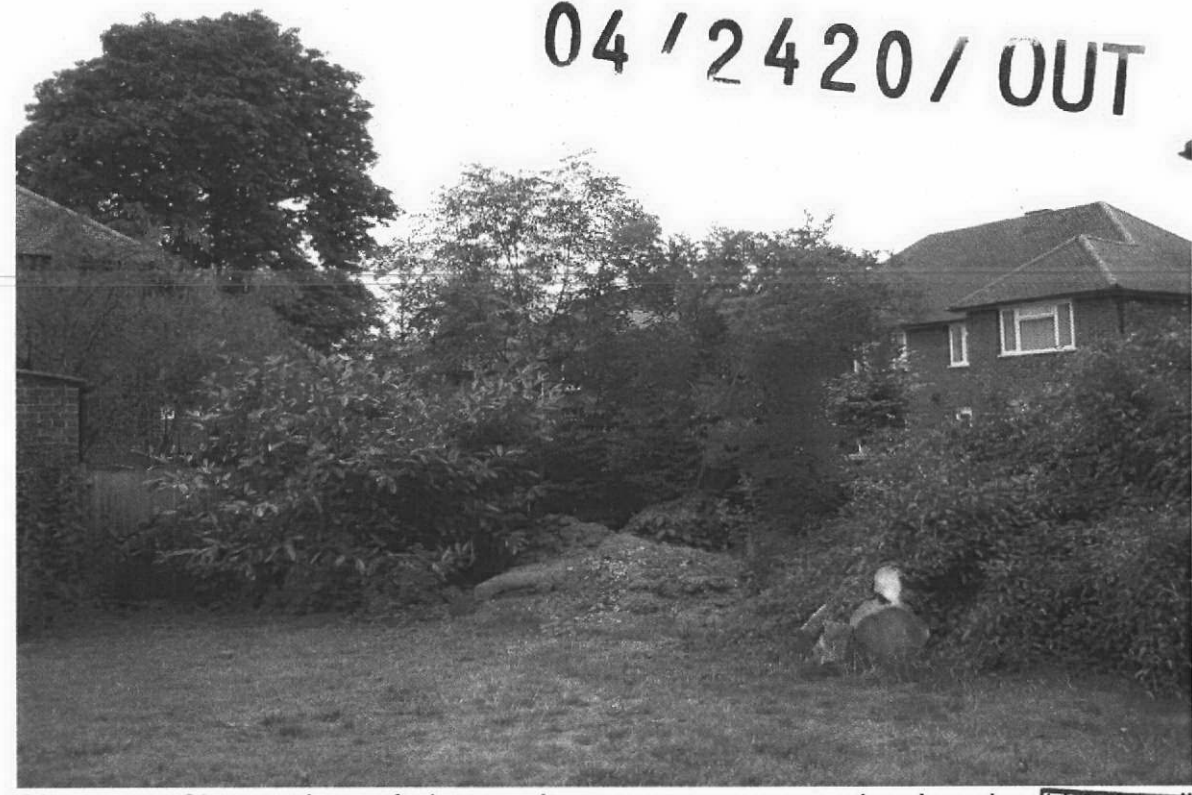
Photo 6: Closer view of the north-east corner area showing the situation with undergrowth and garden waste.

dead end LONDON BOROUGH OF RICHMOND UPON THAMES 27 JUL 2004 PLANNING