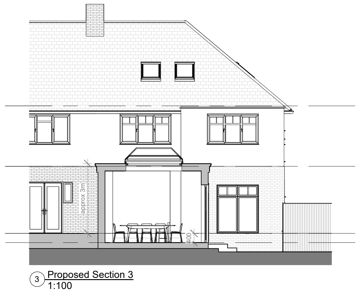
3 Proposed Section 3 1:100