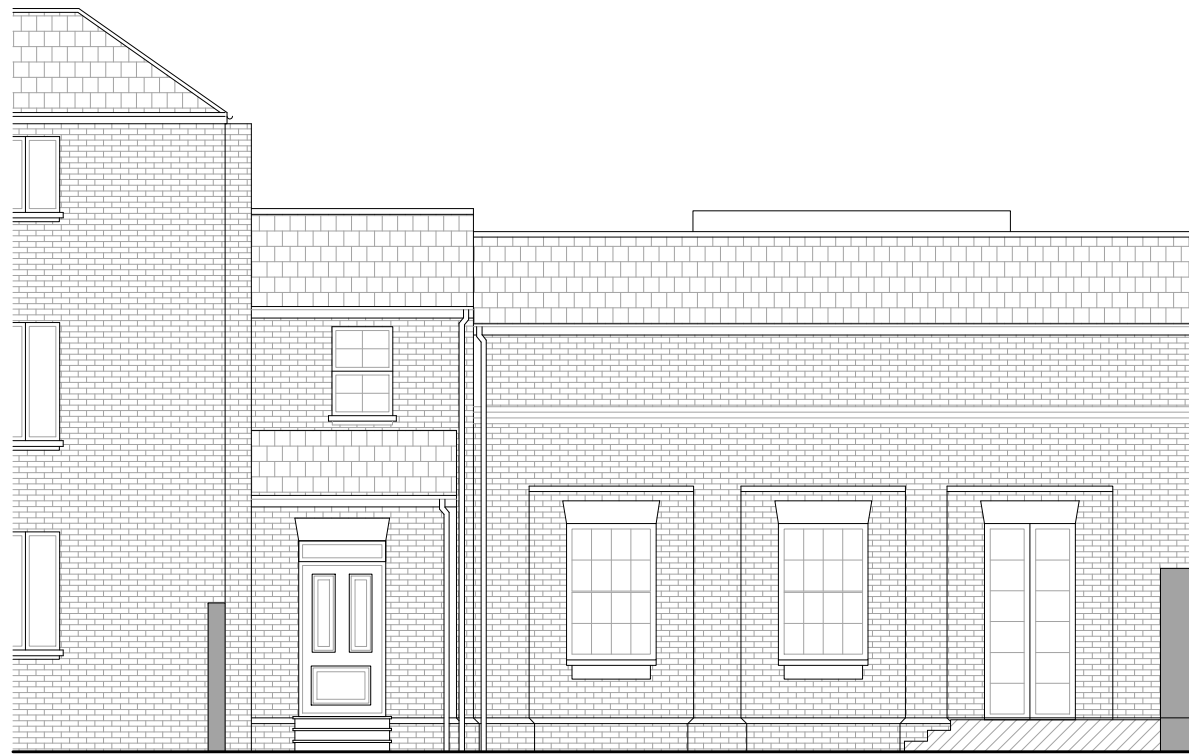
01 Proposed Front Elevation (No change to property) 1:100 @ A3