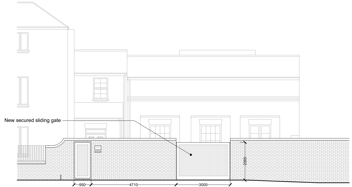
02 Proposed Boundary Wall Elevation 1:100 @ A3