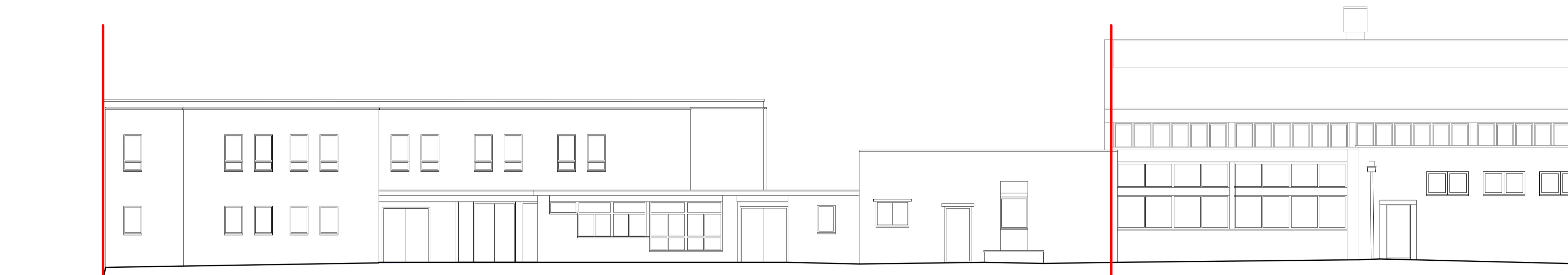
1 EXISTING NORTH ELEVATION 1 : 100