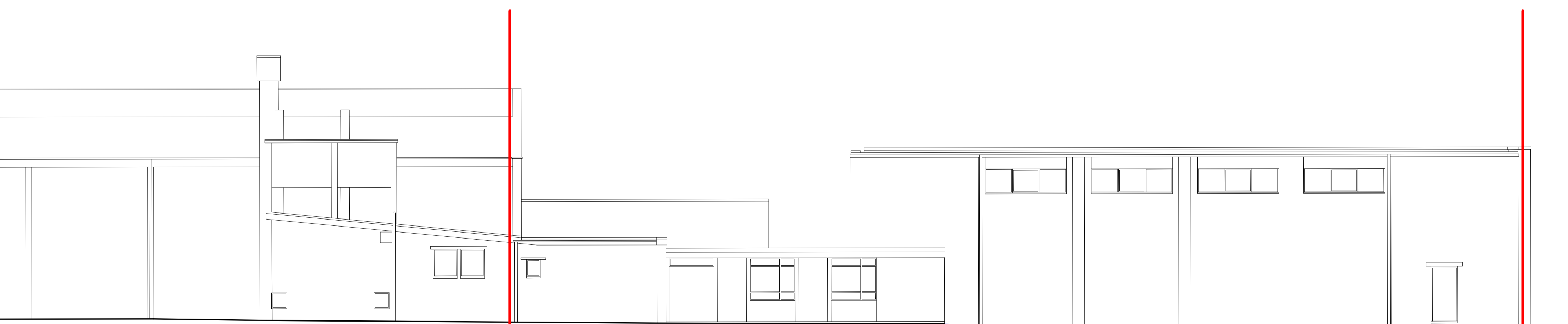
3 EXISTING SOUTH ELEVATION 1 : 100