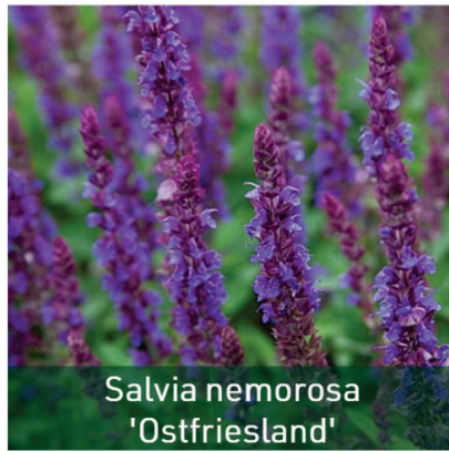
Salvia nemorosa 'Ostfriesland'