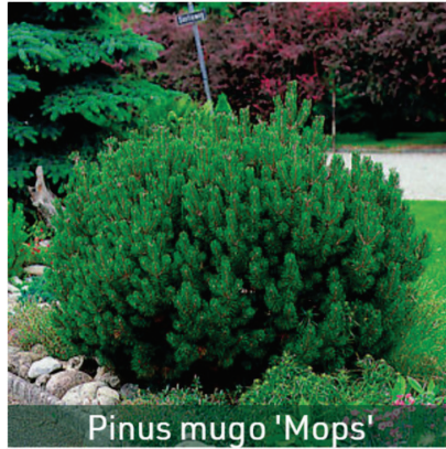
Pinus mugo 'Mops'