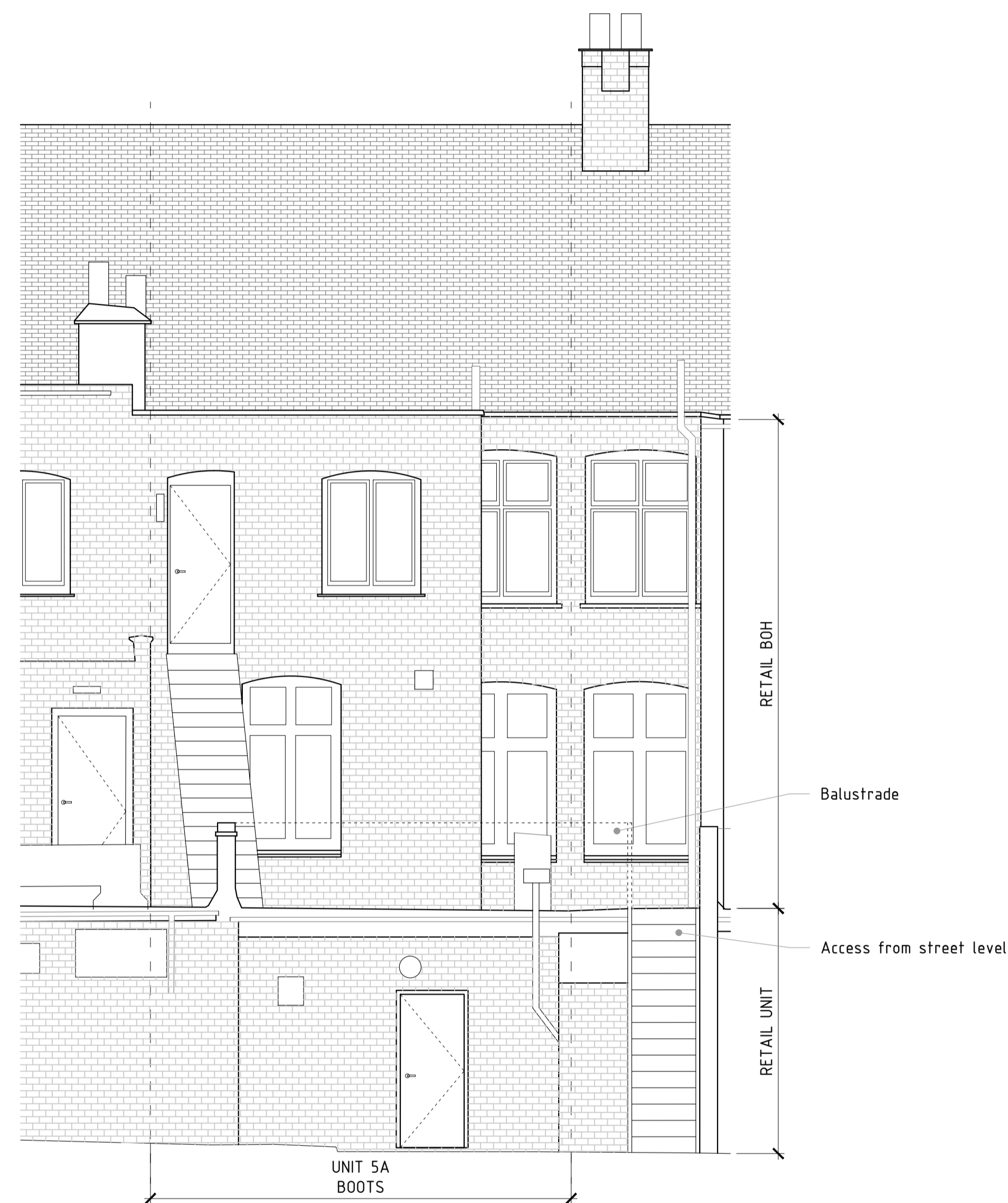
B Rear Elevation Scale 1:50