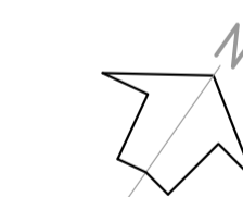
0m 2m 4m 6m 8m 10m Scale 1:200 @ A1