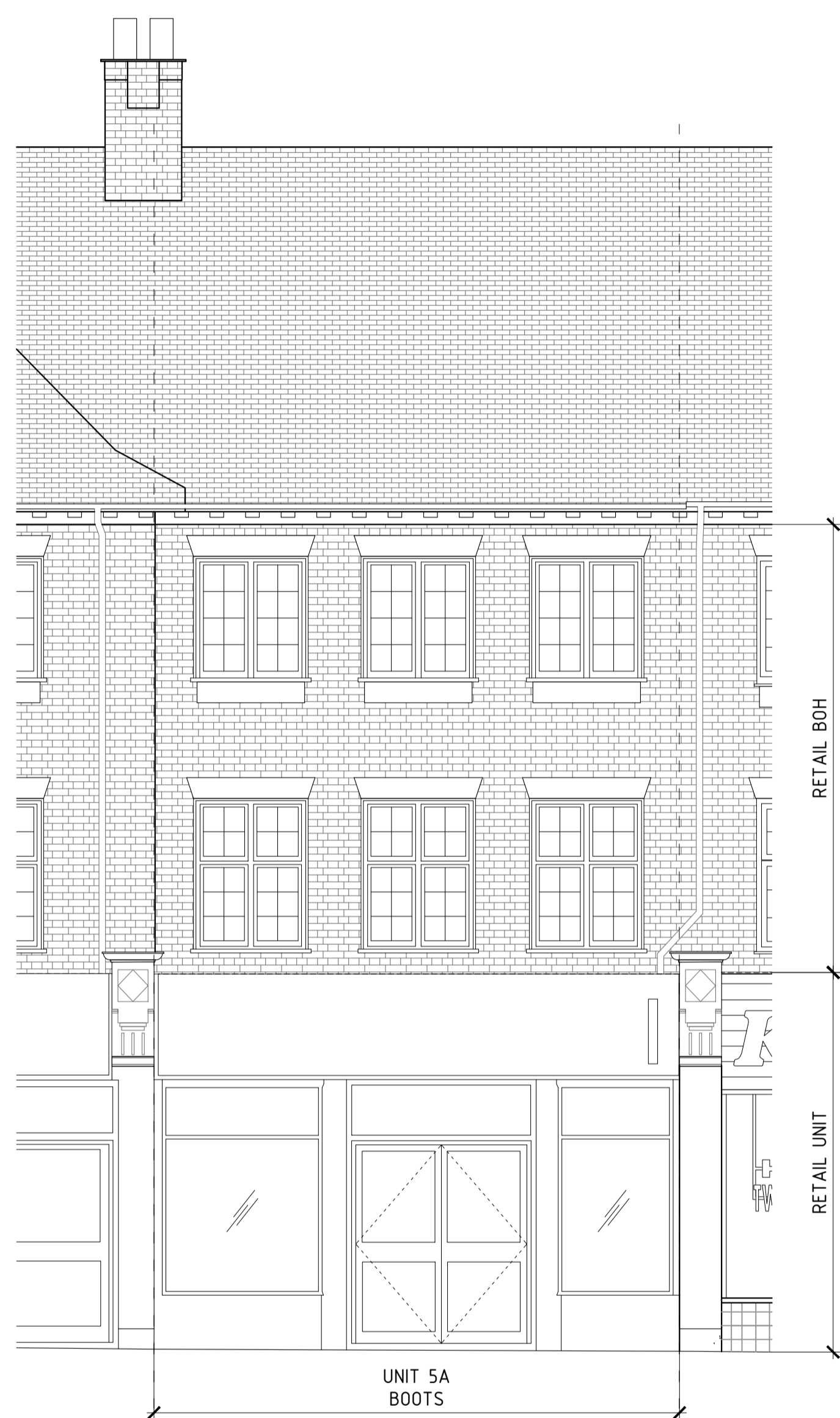
A Front Elevation Scale 1:50