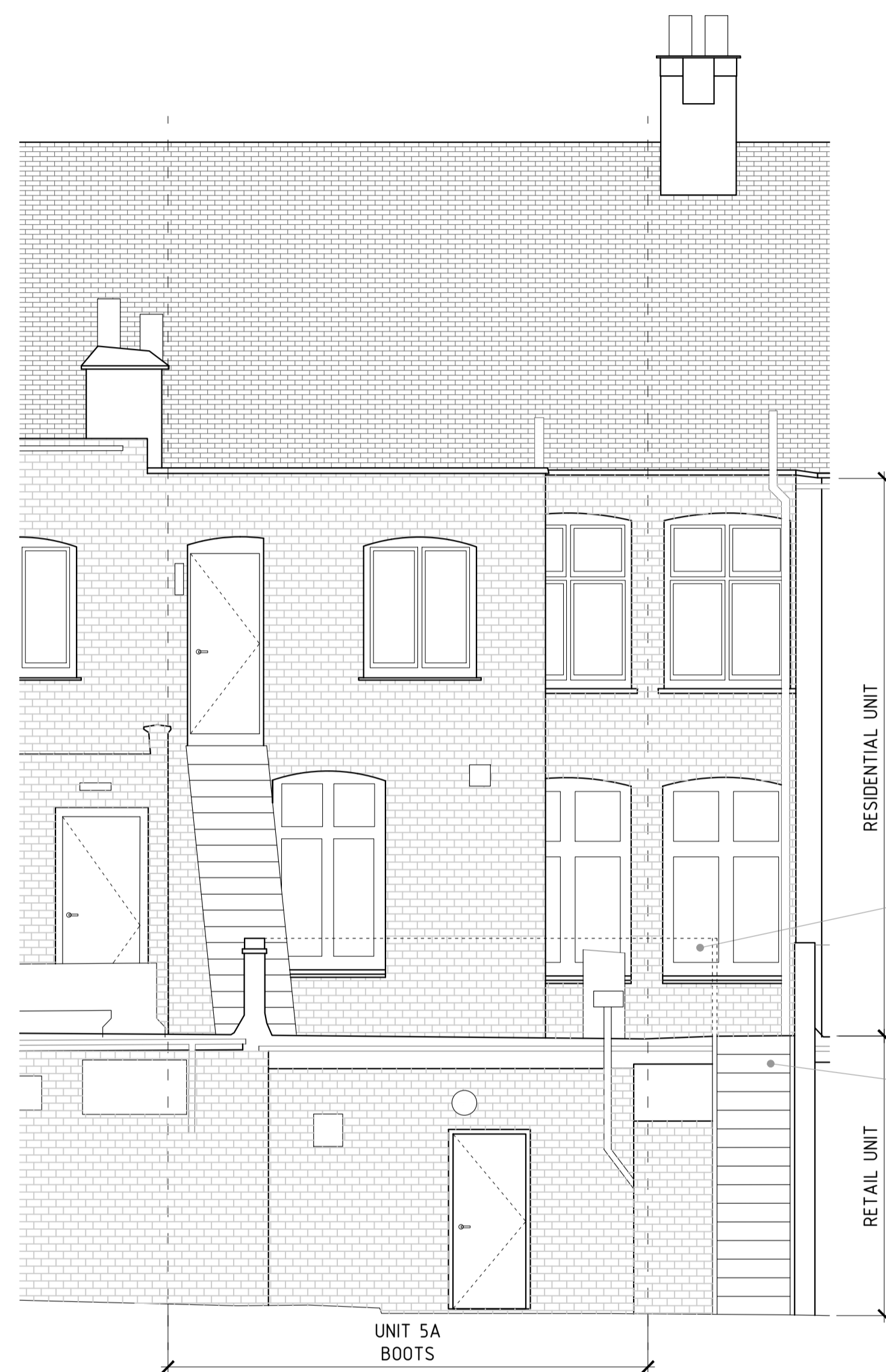
B Rear Elevation Scale 1:50