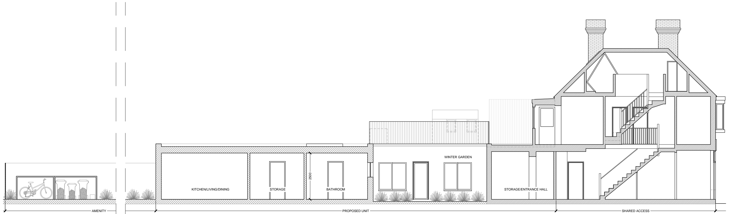
Side Elevation & Section A