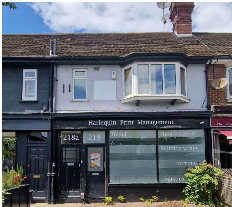
Front photo – 10/06/2024

Confirming that the site has not been used since then: