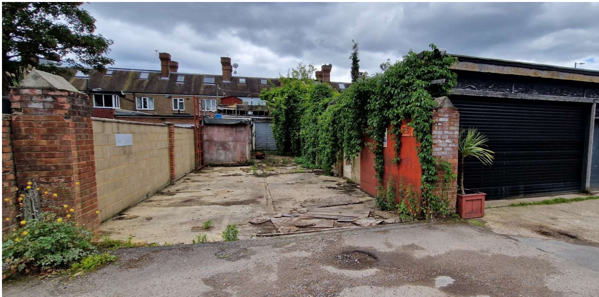
Existing rear photo

and enhance the biodiversity levels which is nil. The property would include low level native species on the boundaries and winter gardens along with lawned areas that are currently paved with no natural drainage or biodiversity opportunities.