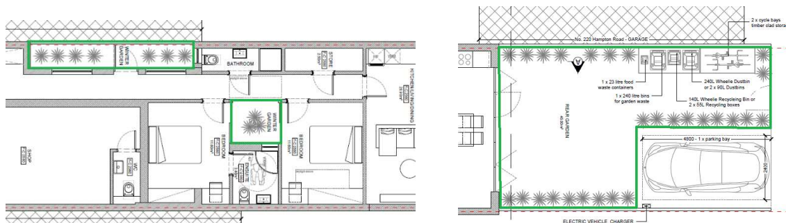
Rear garden and winter gardens

The proposals would meet and exceed the minimum requirement set out in the London Plan 2021 where each 1-bed, 2-person self-contained private unit must provide 5 sqm of amenity space, with an additional 1 sqm per additional resident.