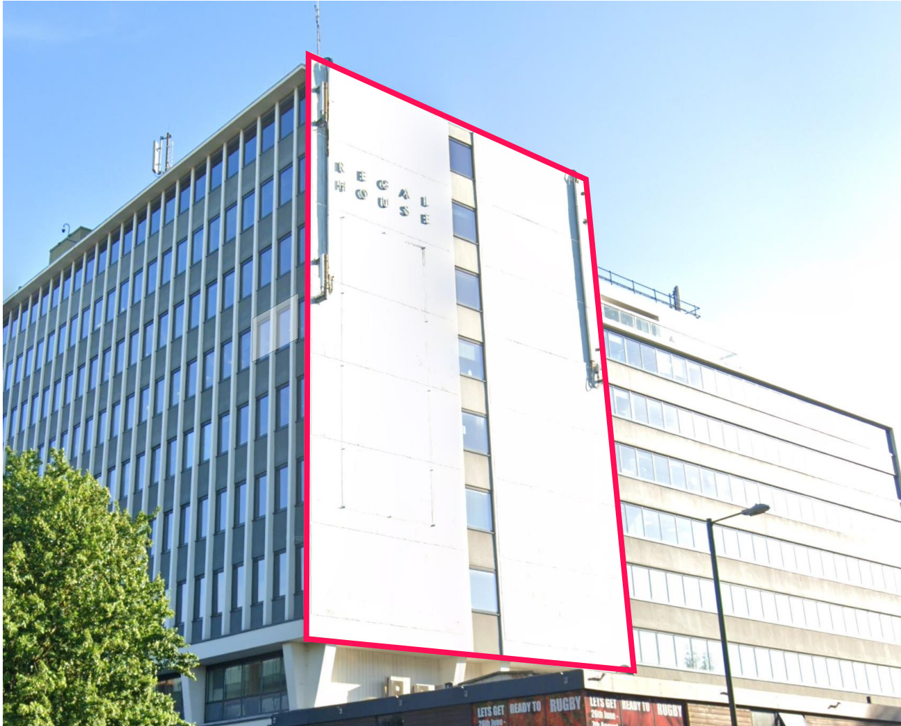
Regal House - back of the building facing South 70 London Rd, Twickenham TW1 3QS