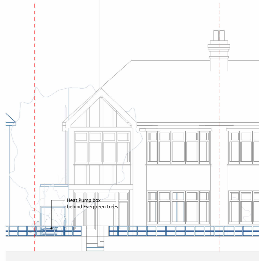
Proposed front elevation 1 : 100