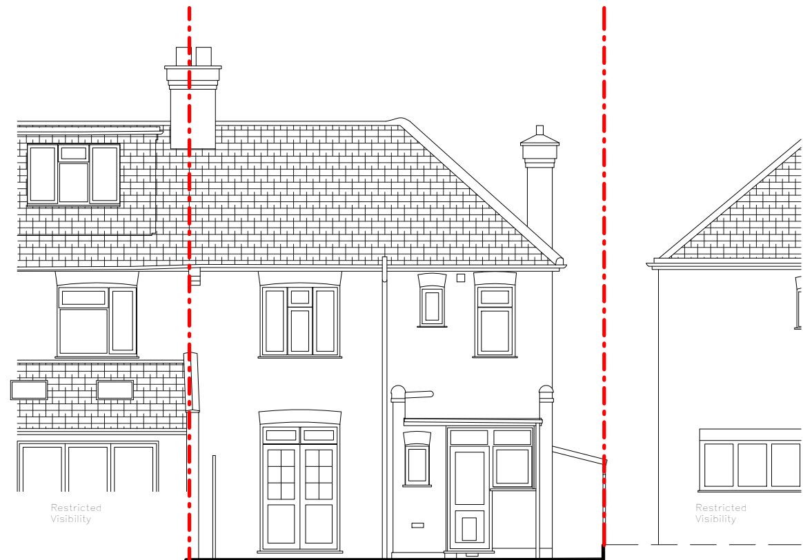
Existing Rear Elevation 1 : 100