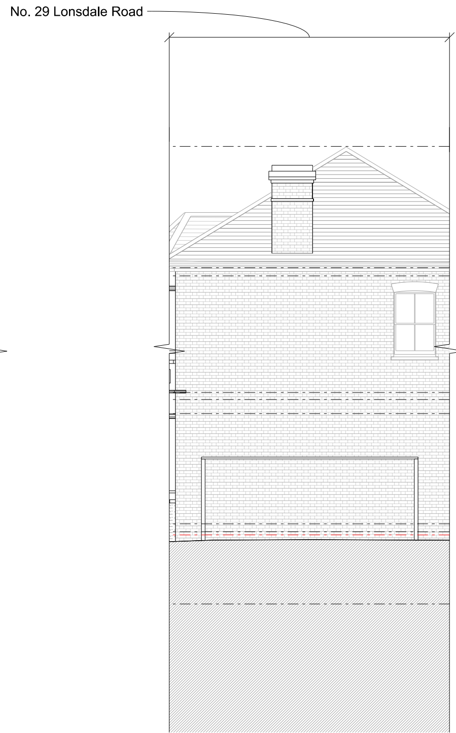
02 Existing Elevation 1:100 Side Passage