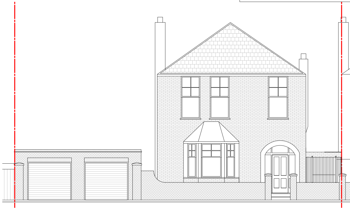
EXISTING FRONT ELEVATION A-A