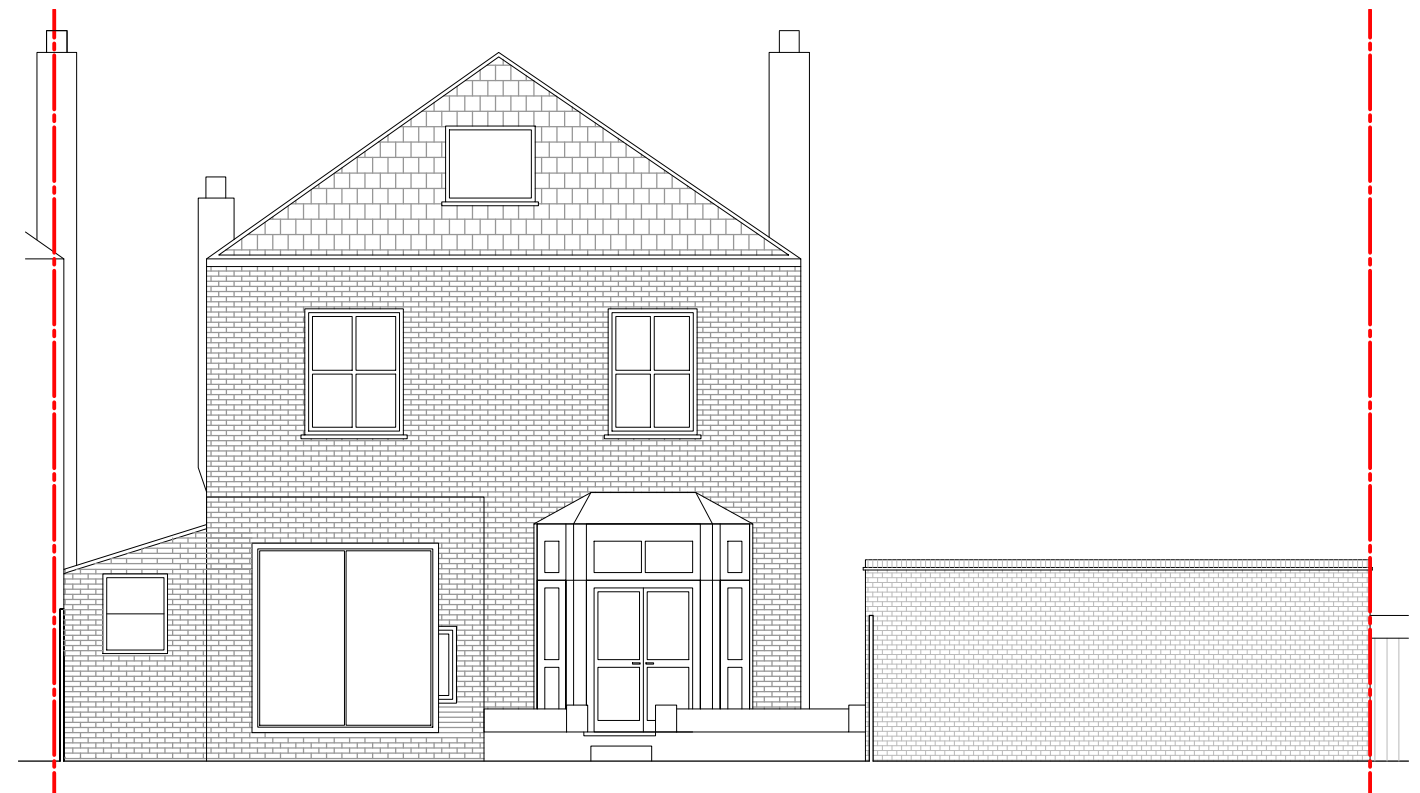
EXISTING REAR ELEVATION C-C