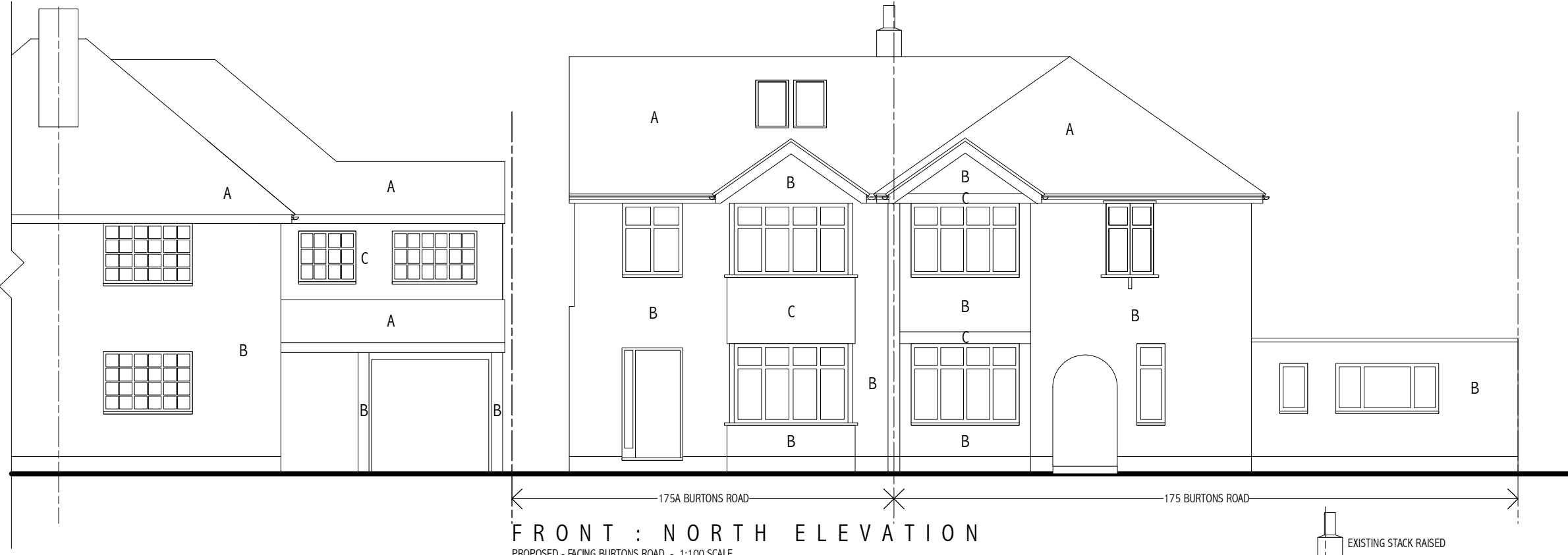
FRONT : NORTH ELEVATION PROPOSED - FACING BURTONS ROAD - 1:100 SCALE