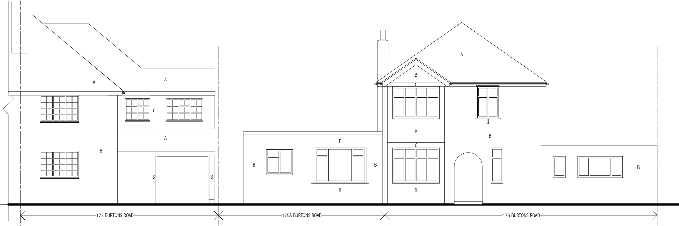
FRONT : NORTH ELEVATION EXISTING - FACING BURTONS ROAD - 1:100 SCALE